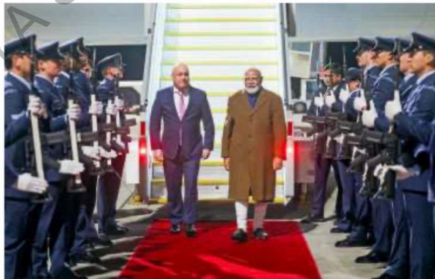
Prime Minister Narendra Modi with his New Zealand counterpart Christopher Luxon at the Auckland airport on Friday.

During his two-day visit, he will hold talks with Mr.