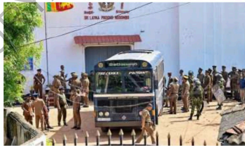
Security personnel escort prisoners to a bus at Negombo Prison on the outskirts of Colombo following clashes between inmates.

The victim, Sarathchandra U., 73, was killed in the deadly clashes that broke out in a prison in Negombo, located about 35 km north of Colombo and adjoining the Bandaranaike International Airport, on July 6. A total of 28 persons, including eight