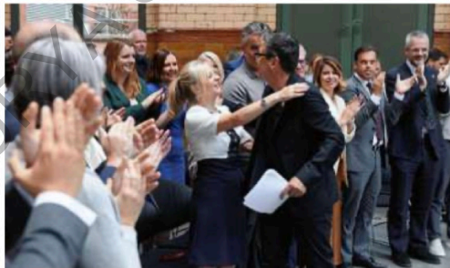
Andy Burnham being greeted as he arrives to deliver a speech at the People's History Museum in Manchester, Britain.

The support of 81 MPs is needed to contest any internal election; Mr. Burnham was officially one MP short, as of Friday afternoon, of ensuring that he would be the only candidate in the fray. Four other MPs had declared support for the former Mayor but had not officially nominated him, as per Labour List, a website that tracks news from the party. Mr. Burnham is expected to be ap-