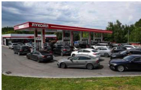
People queue to refuel their cars at a petrol station in Moscow on Friday as Ukrainian strikes on refineries crimp domestic supply.

Russian leader Vladimir Putin has acknowledged that the Ukrainian strikes