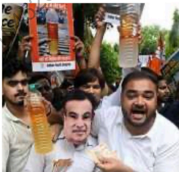
Activists protesting in New Delhi against the fuel policy on Friday. SUSHIL KUMAR VERMA

This statement, issued on Friday as an FAQ document by the Ministry of Petroleum and Natural Gas, comes at a time when critics are questioning why fuel with 20% ethanol is not cheaper than pure petrol or fuel with 10% ethanol.