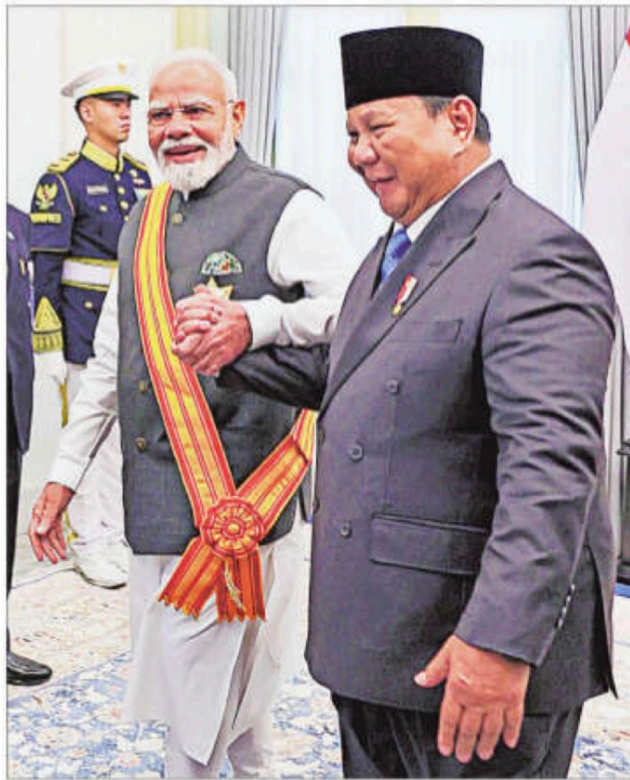
PM Narendra Modi with President Prabowo Subianto after being conferred the Bintang Adipurna of the Republic of Indonesia, the country's highest civilian honour, in Jakarta, Tuesday. I AM A GREAT ADMIRER OF PM MODI: SUBIANTO PAGE 6

On table: Two BrahMos missile batteries worth $200 million