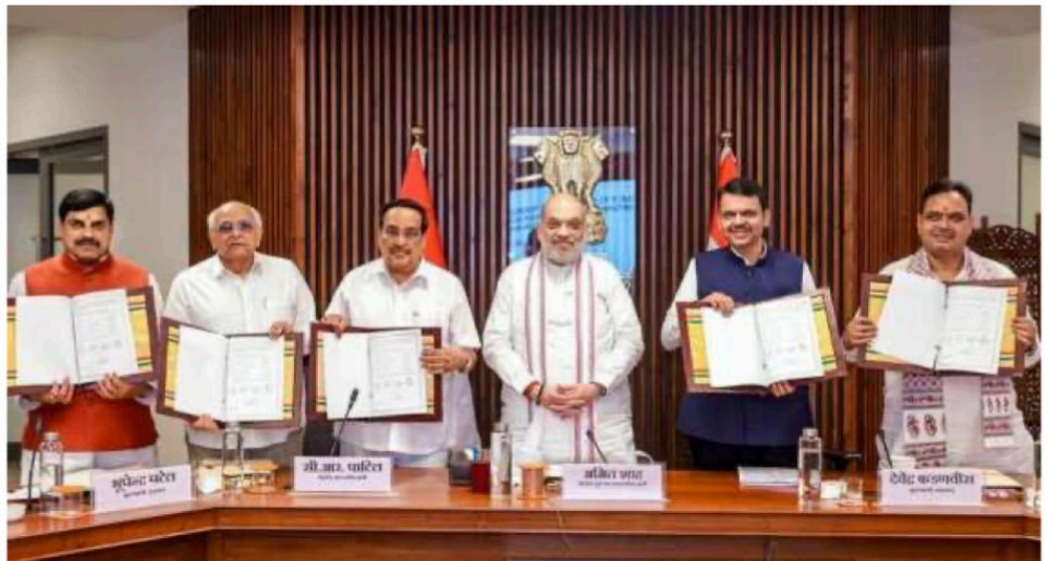
Common platform: Union Home Minister Amit Shah and Union Minister of Jal Shakti C. R. Patil with the Chief Ministers of Madhya Pradesh, Gujarat, Maharashtra, and Rajasthan.

Under the agreement, the payments to be made towards the final settlement of pending dues have been resolved through a one-time settlement. Mr. Shah said that the issue of pending payments under the Narmada Award had remained unresolved among the four States for a long time, and that it had been resolved