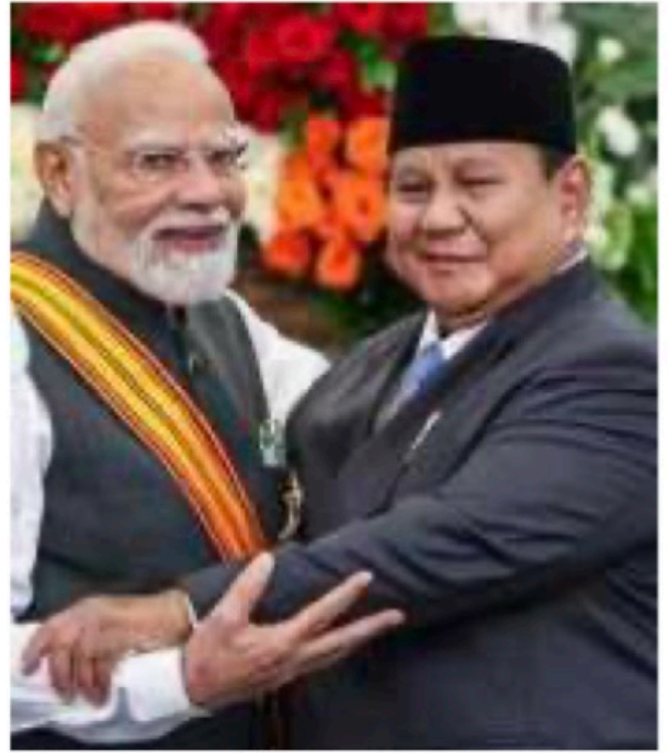
Prime Minister Narendra Modi with Indonesian President Subianto on Tuesday.

A joint statement issued at the end of the official dialogue between Mr. Mo-