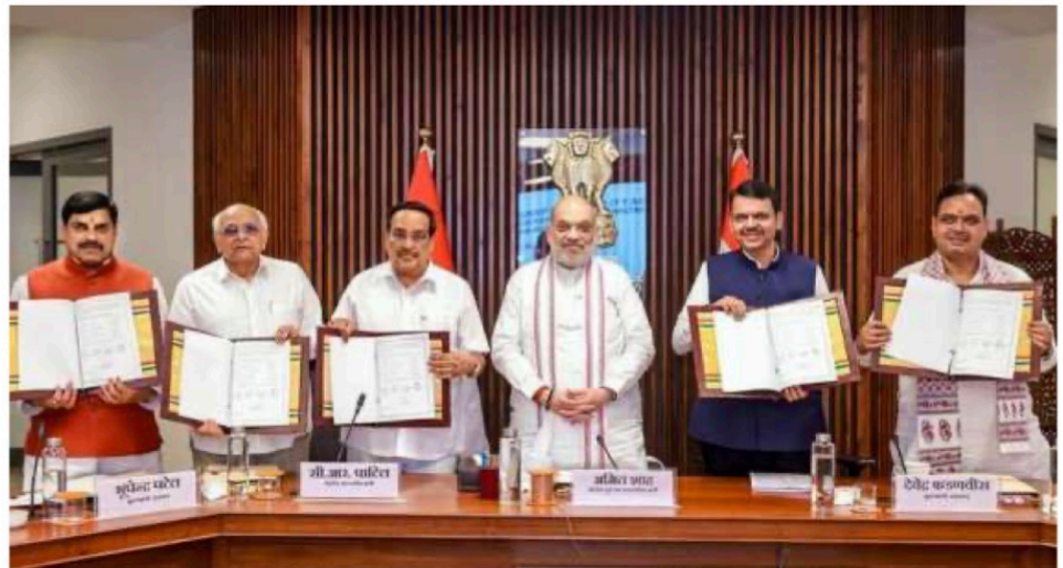
Common platform: Union Home Minister Amit Shah and Union Minister of Jal Shakti C. R. Patil with the Chief Ministers of Madhya Pradesh, Gujarat, Maharashtra, and Rajasthan.

Under the agreement, the payments to be made towards the final settlement of pending dues have been resolved through a one-time settlement. Mr. Shah said that the issue of pending payments under the Narmada Award had remained unresolved among the four States for a long time, and that it had been resolved