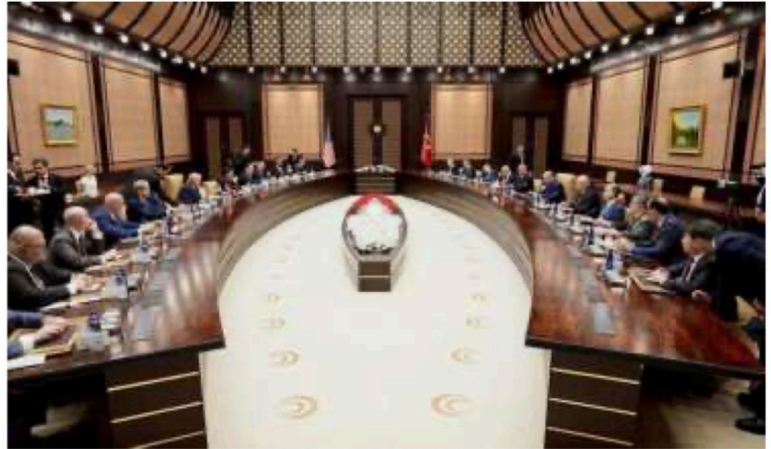
Donald Trump and American officials meet with Recep Tayyip Erdogan and Turkish officials in Ankara on Tuesday.

ed with NATO,” Mr. Trump said, sitting next to Mr. Erdogan at the latter’s vast presidential palace.