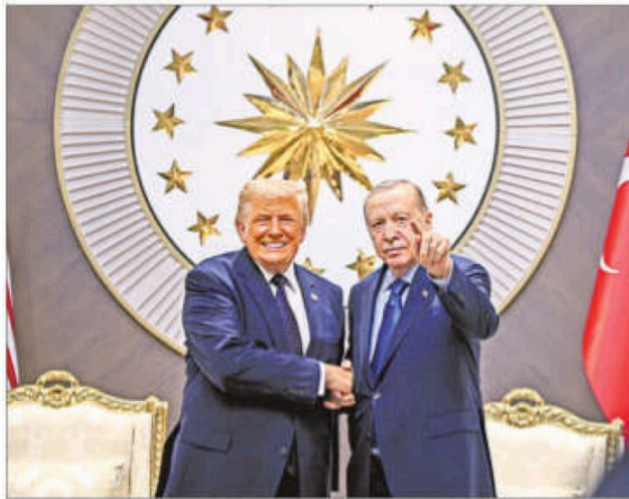
US President Donald Trump with Turkish President Recep Tayyip Erdogan in Ankara on Tuesday.

Trump added "we weren't treated well" by the allies, even as he reiterated that he did not want or need their help. "Before I asked, they said they wouldn't be there, and we've invested trillions of dollars in NATO," Trump said.