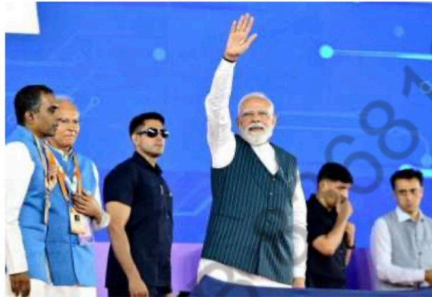
Future ready: Prime Minister Narendra Modi at the semiconductor facility in Sanand, Gujarat, on Saturday. VIJAY SONEJI

He said the plant reflected the government's vision of 'Design in India' and 'Make in India' and noted that he had laid the foundation stone for the project in 2024, chip testing began