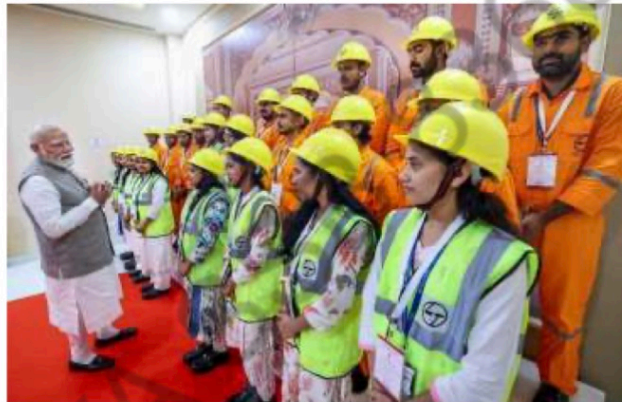
Crucial sector: PM Narendra Modi during the inauguration of the HRRL petrochemical complex in Balotra, Rajasthan, on Saturday.

The country avoided fuel rationing, ensured cooking gas supplies, and shielded consumers and farmers from global price spikes, with state-run oil marketing firms (OMCs) bearing the losses, he said, adding that certain politically motivated entities which had engaged in rumour-mongering during the crisis had failed and