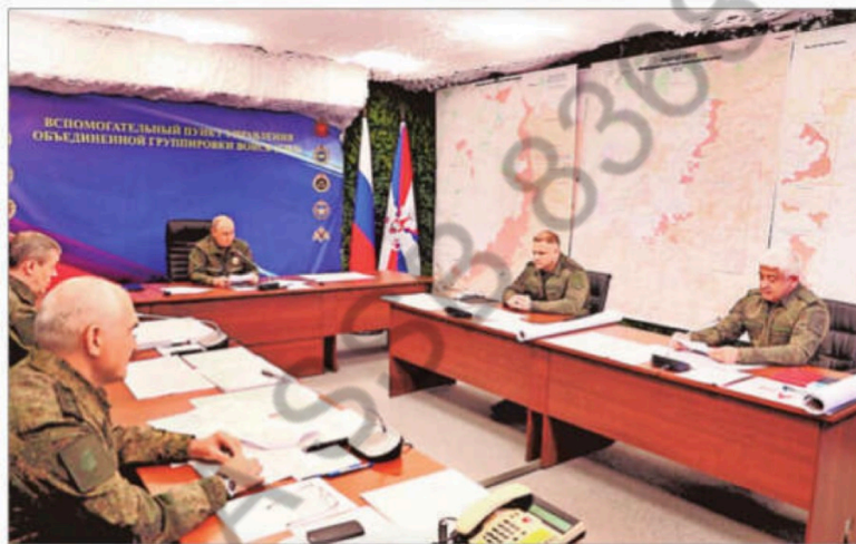
Russian President Vladimir Putin chairs a meeting as he visits a command post of Russia's joint force grouping at an unidentified location on Friday.

"The Ukrainian defence forces hit the port oil infrastructure, which earns money for the Russian war, and there were