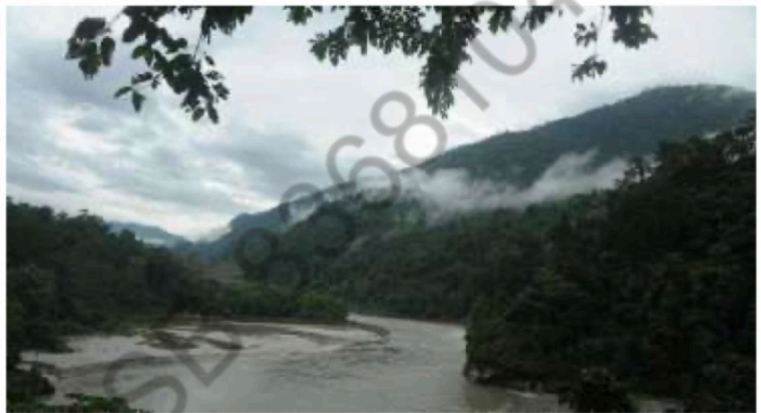
Pristine waters: A view of the Teesta river at Sevok, some 20 km from Siliguri.

The issue came up during a press briefing when the official spokesperson of the External Affairs Ministry, Randhir Jaiswal, was asked a question on whether the Bangladesh-China decision to have a feasibility report on the TRCMRP will impact In-