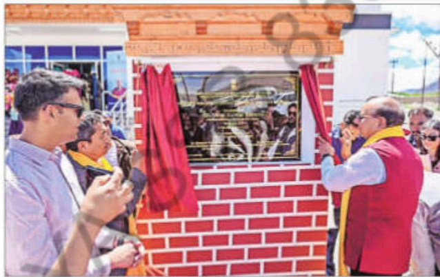
Ladakh Lieutenant Governor Vinai Kumar Saxena inaugurates an indoor sports facility at Chuchot Gongma, Friday.

DAYS AFTER Ladakh observed a shutdown over what its leaders alleged were omissions in the official record of their talks with the Centre, the Ministry of Home Affairs (MHA), moving to address concerns over the government's commitment to its assurances, has incorporated key provisions in the final minutes of the May 22 meeting that resulted in a breakthrough after months of protests and negotiations.