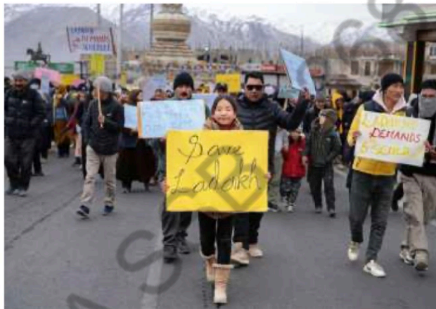
Civil society groups in Ladakh have been consistently demanding Statehood for the Union Territory.

The MHA note said the next logical step would be to further empower the UT