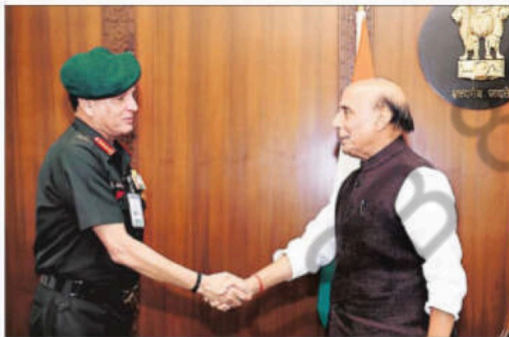
Defence Minister Rajnath Singh with the new Chief of Army Staff, General Dhiraj Seth, in New Delhi on Thursday.

The DAC is the key defence body that grants Acceptance of Necessity (AoN) on all big-ticket capital procurements. The AoN is the first step in the defence procurement process. However, obtaining an AoN does not always lead to a final