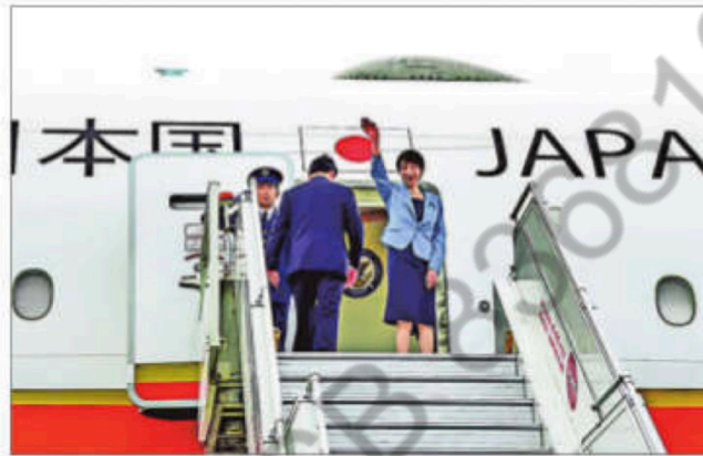
Japanese Prime Minister Sanae Takaichi waves before departing for Japan after concluding her India visit, at the airport in New Delhi on Friday.

“Safeguarding post-war international order and purposes and principles of the UN Charter is the foundation of the prosperity and stability in the Asia Pacific, as well as the