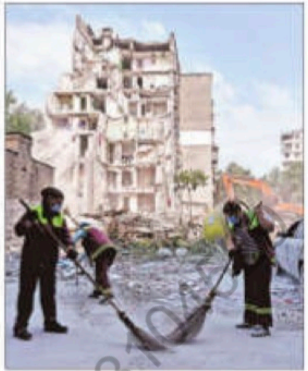
Municipal workers sweep the damaged site after Russia's missile attack in Kyiv on Friday.

At the very least, the attacks have brought the war home even more poignantly for millions of Russians, shattering Putin's narrative of the conflict as something that doesn't affect