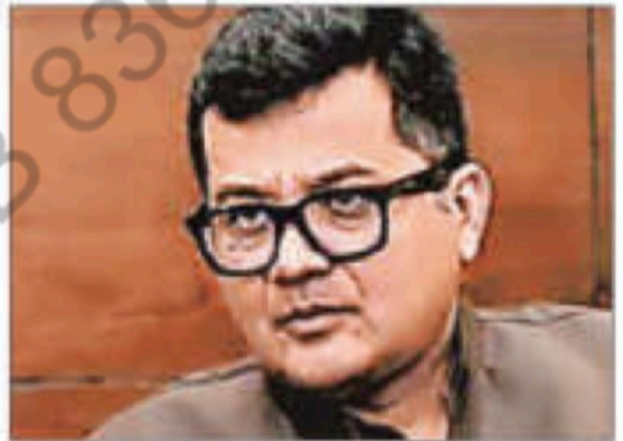
(Top) Bihar Governor Lt Gen Syed Ata Hasnain (retired); Minister of State for External Affairs Pabitra Margherita

in Tehran on July 4, and he will be laid to rest in his home town of Mashhad on July 9.