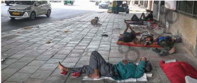
The big count: Homeless people sleeping under a bridge at Wazirabad in New Delhi on Monday. BLOs would visit every registered address even if it were a temporary location, the CEO said.

"Since their houses at the registered addresses may have been demolished by the time of the Booth Level Officer (BLO)'s visit, and they might not be able to obtain alternative residence proof during the duration of the SIR, we will work out a plan to ensure their inclusion," he said at a press conference.