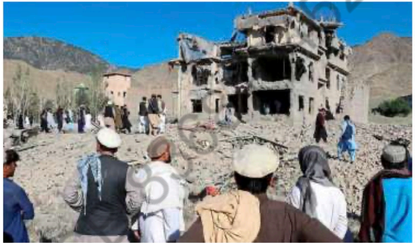
In ruins: Afghan residents looking at a building damaged in a Pakistani air strike at a village in Paktia province on Monday.

Pakistan's Information Minister Attaullah Tarar said air and ground operations killed 29 militants and were aimed at a group that it blames for a deadly weekend assault in Karachi, although Afghan authorities have repeatedly denied their territory harbours attackers. The Taliban regime said the air