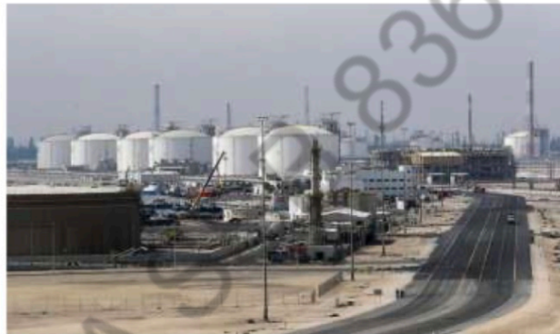
Incident zone: The blast occurred during start-up of operations at Ras Laffan Industrial City, officials said. FILE PHOTO

Earlier, during a press briefing on Monday, the country's Energy Minister Saad al-Kaabi confirmed that 13 people of Indian and Pakistani origins have died in the incident. He reported that 66 people of various nationalities were