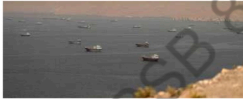
The waiver covers financial transactions on ship operations. FILE

With the peace process moving ahead after an interruption, the U.S. Treasury Department has issued a waiver that waives all sanctions for a period of 60 days ending August 21 related to the production, sale, delivery and offloading of Iranian crude oil as well as petroleum products. The waiver includes