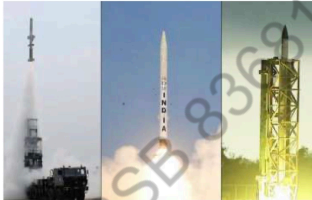
The tests showcased a multi-layered ballistic missile defence system and the anti-ship missile.

It further mentioned that the multi-layered BMD capability was successfully demonstrated with inter-