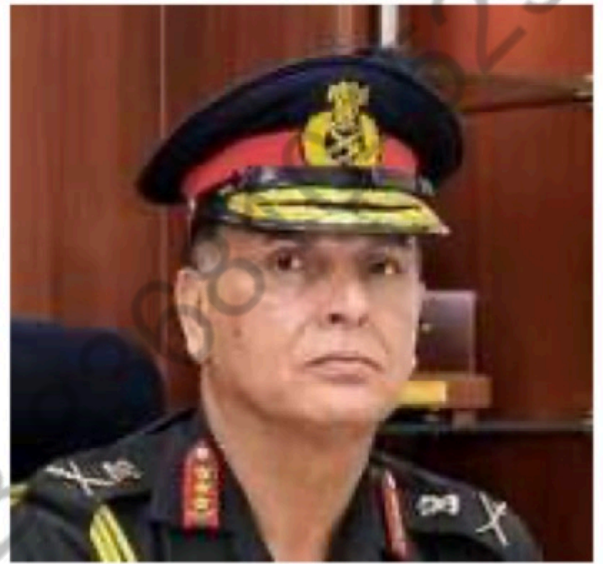
Lieutenant-General Dhiraj Seth

Lt. Gen. Seth assumed charge as the Vice-Chief of the Army Staff on April 1, 2026. An alumnus of the National Defence Academy, Khadakwasla, Lt. Gen. Seth was commissioned into the Armoured Corps in 1986. Over a distinguished career spanning nearly four decades, he has served in a variety of oper-