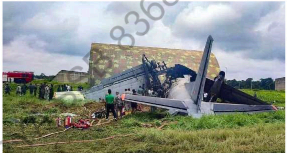
Landing accident: Security personnel and others near the remains of the An-32 transport aircraft of the IAF that crashed while landing in Jorhat district, Assam, on Saturday.

The IAF did not provide details of the accident, but said it occurred at 10 a.m.