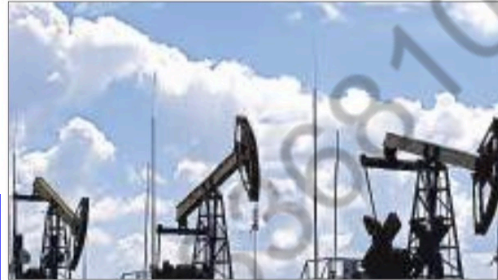
Oil, gas, and mineral exploration activities have remained suspended in the contested area for three decades now.

lease, apart from six designated oil and gas fields, the Nagaland government has agreed to oil exploration across Nagaland.