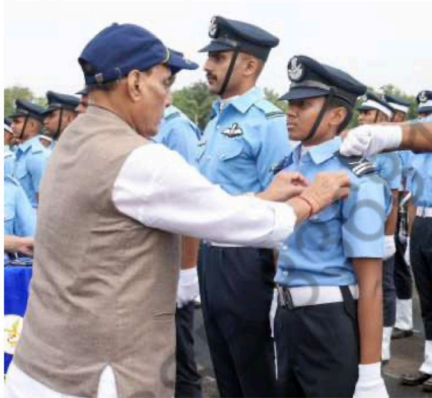
Defence Minister Rajnath Singh awards Wings to a woman cadet at the Air Force Academy in Hyderabad on Saturday.

dets graduated after completing their pre-commissioning training across various branches of the IAF. The graduating batch comprised 194 men and 37 women. Wings were also awarded to nine officers of the Indian Navy, three officers of the Indian Coast Guard and two trainees from the Socialist Republic of Vietnam on the successful completion of flying training, while three officers received brevets after completing their navigation training.