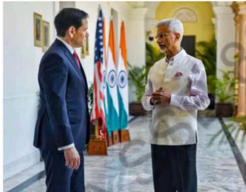
External Affairs Minister S. Jaishankar during a meeting with U.S. Secretary of State Marco Rubio, in New Delhi in May.

The two discussed the Strait of Hormuz situation following the U.S. missile strikes on three vessels – Marivex near Duqm, and Settebello and Jalveer near