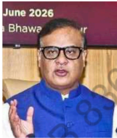
Himanta Biswa Sarma

According to the blueprint, any "genuine" per-