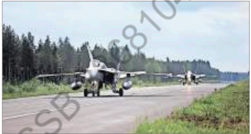
F/A 18 Hornet multi-role fighter jets take off from a road strip during NATO's Ramstein Flag 26 exercise in Trevo, Finland. FILE

The reduction in available American military assets include an aircraft carrier strike