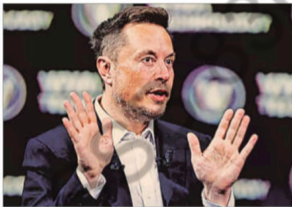
Shares open at $150 a piece, up from $135 IPO price.

"Whoever you are watching this, SpaceX wants to be able to take you to the moon, take you to Mars and ultimately beyond." Known for his technology breakthroughs, as well as wild claims and missed deadlines, Musk was widely expected to break the trillion dol-