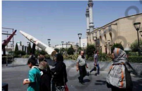
Teetering deal: People walk next to a symbolic mock-up of an Iranian missile, on a street in Tehran, Iran, Thursday.

"The Islamabad Memorandum of Understanding has never been closer. Pending its finalization, the media should refrain from entering speculation about its content. In line with our responsible and transparent approach, all details will be shared with the public in due course," Mr. Araghchi wrote in a social media post. Mr. Trump re-