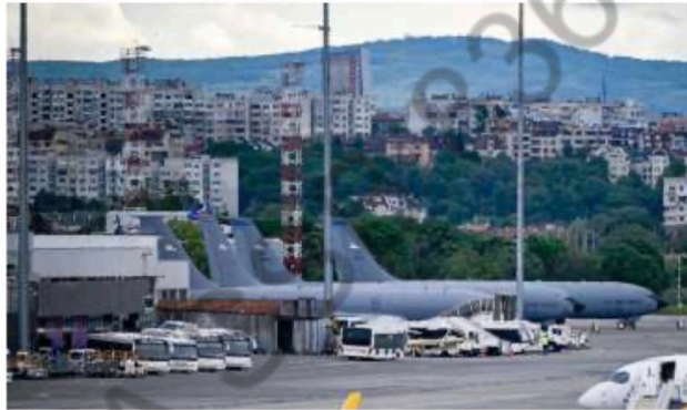
U.S. Air Force Boeing KC-135 Stratotanker air refuelling aircraft parked at Sofia's Vasil Levski Airport in Bulgaria.

U.S. President Donald Trump has called the alliance a "paper tiger" and its members "cowards" in frustration that they have