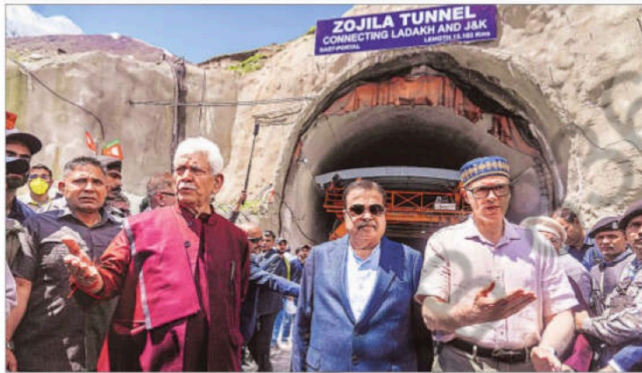
Union Minister Nitin Gadkari, J&K L-G Manoj Sinha and CM Omar Abdullah at Meenamarg on Tuesday. P11

The Zojila Tunnel is set to become the world's longest bi-directional single-tube road tunnel at such a height. The tunnel forms the centerpiece of the 30.894-km Zojila project, which includes roads, bridges and tunnels aimed at ensuring year-