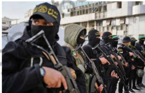
Supreme power: Hamas has run Gaza for nearly two decades since seizing control of the territory from the Palestinian Authority.

The commission found that Hamas-affiliated militants and police forces were involved in nearly one-fourth of the 249 documented cases – including 108 deaths – from August 2024 to January 2026. The commission specifically investigated cases involving Hamas-affiliated forces but