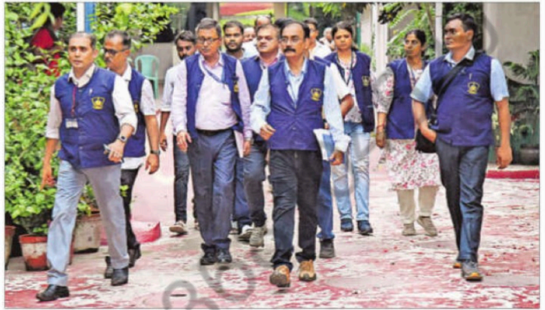
A CID team during one of the searches in Kolkata on Tuesday.

He has challenged the CID summons before the Calcutta High Court.