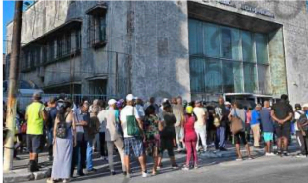
People queue outside a bank in Havana as U.S. sanctions prompt a foreign bank to sever ties with a financial institution in Cuba.