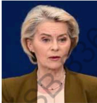
Ursula von der Leyen

“Brick by brick, we are collapsing the foundations of Russia’s war economy,” the EU’s top diplomat Kaja