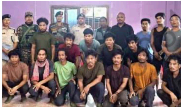
The Manipur Police secured the route to ensure the safe passage of 14 Kuki men to Taphou Kuki Village.

The United Naga Council (UNC), the apex body of the Nagas in Manipur, had