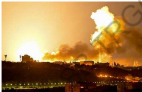
Explosions during overnight drone and missile attacks light up the Kyiv skyline on Tuesday, amid the Russian invasion in Ukraine.

from night into day and the boom of explosions reverberated across cities. Officials said that 12 people were killed in Dnipro and six in Kyiv.