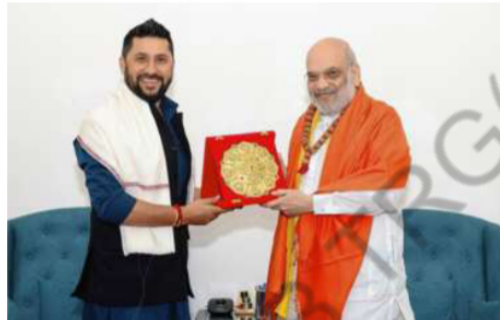
Union Home Minister Amit Shah greets Chairman of the Rastriya Swatantra Party Rabi Lamichhane in New Delhi.

Addressing presspersons, Ministry spokesperson Randhir Jaiswal responded to the claims made by Mr. Shah, who had asserted that the boundary issue was a complex one with both India and Nepal having possession of each other’s territory and had sought intervention of countries like the U.K. and China. The Ministry’s response to the Nepali Prime Minister coincided with the visit of Rabi Lamichhane, chairman of the