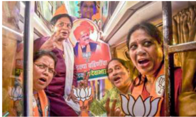
Opposition parties have alleged that the government is weeding out Ladki Bahin beneficiaries due to a 'severe financial crisis'. FILE PHOTO

"The Comptroller and Auditor General raised questions over the scrutiny of beneficiaries and a verification was conducted. Five lakh beneficiaries had government jobs, 10 lakh had an income of over ₹2.5 lakh, and 14,000 men had benefited under the scheme for women. After analysing several sets of data, the beneficiaries were removed," Mr. Fadnavis said while speaking to reporters ahead of the weekly Cabinet meeting. He added that the instalments credited to 14,000 men will be re-