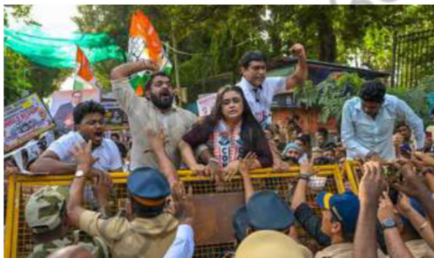
Youth Congress members protest seeking the resignation of the Union Education Minister in Mumbai on Tuesday.