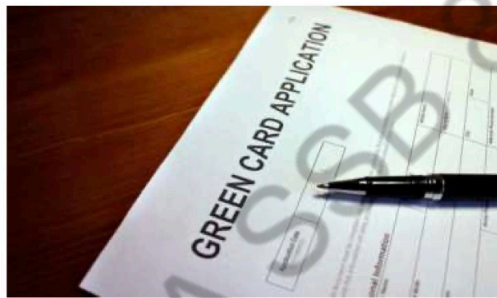
The Trump govt. says non-immigrants should not use a temporary visit as the first step toward permanent residence.

For over half a century, foreign nationals with legal status have been able to apply for and complete the entire process for permanent residence in the United States – including individuals married to U.S. citizens, holders of work