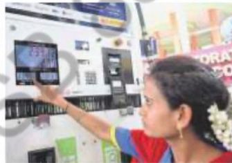
An employee points to the revised petrol price at a Bharat Petroleum outlet in Vijayawada, Andhra Pradesh on Saturday.

price of petrol in Delhi rose by 87 paise to ₹99.51 per litre, and that of diesel by 91 paise to ₹92.49 per litre. CNG in the National Capital Territory (NCT) of Delhi is now priced at ₹81.09 per kg.