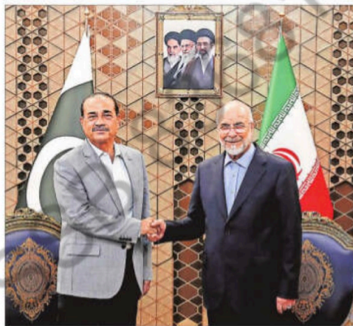
Iran Parliament Speaker Mohammad Ghalibaf (right) with Pakistan army chief Asim Munir in Tehran on Saturday.

US Secretary of State Marco Rubio repeated Trump's demands: "Iran can never have a nuclear weapon. The straits need to be open without tolls. They need to turn over their en-