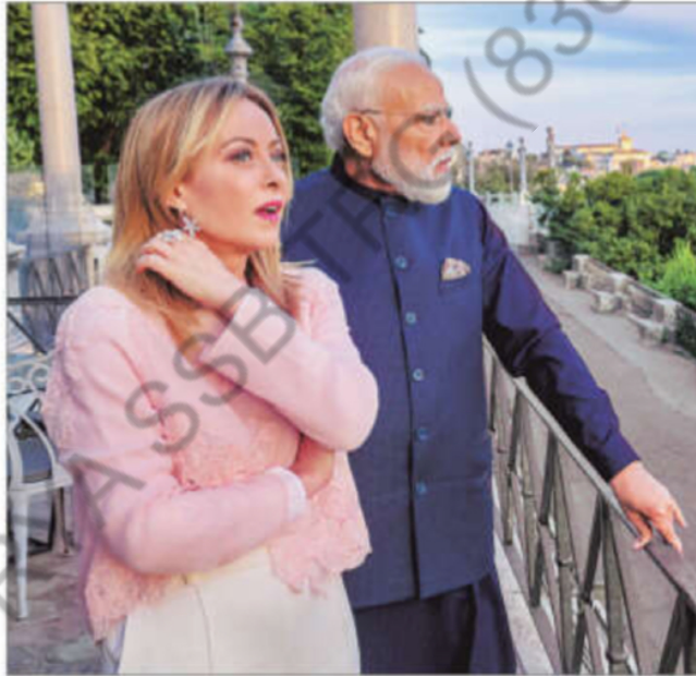
Prime Minister Narendra Modi and his Italian counterpart Giorgia Meloni in Rome, Wednesday. RELATED REPORT, PAGE 5

Opp: Economic storm at home, PM making reels abroad