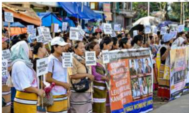
Women protest demanding the release of six missing Naga civilians, at Kanglatongbi village, in Imphal West district of Manipur.

hit Manipur after unidentified gunmen ambushed and killed three Thadou church leaders on May 13. A section of Thadous claims it is a tribe independent of the Kuki tag.