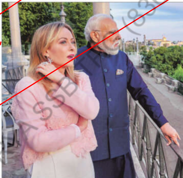
Prime Minister Narendra Modi and his Italian counterpart Giorgia Meloni in Rome, Wednesday. RELATED REPORT, PAGE 5

Opp: Economic storm at home, PM making reels abroad