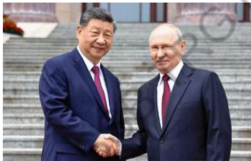
Xi Jinping with Vladimir Putin during a welcoming ceremony at the Great Hall of the People in Beijing, on Wednesday.

Mr. Putin was received by Mr. Xi outside Beijing's opulent Great Hall of the People in much the same fashion as Mr. Trump last week, complete with