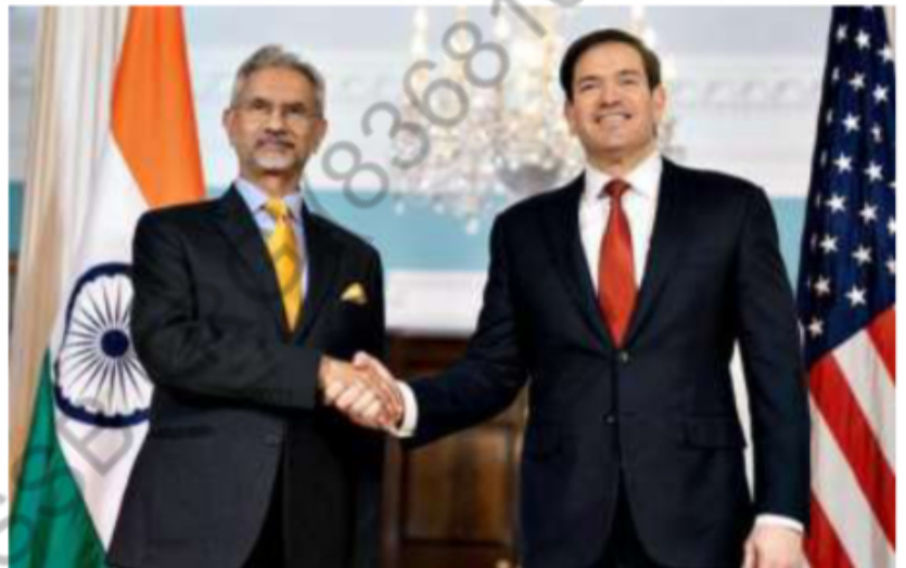
U.S. Secretary of State Marco Rubio, right, with External Affairs Minister S. Jaishankar in Washington.

"As America gets ready to celebrate our 250th birthday, we look forward to doing it with our partners in India. India is the