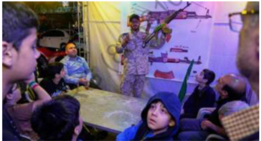
A Basij force member demonstrates how to handle an assault rifle during a weapons training class in Tehran on Tuesday.

U.S. President Donald Trump has repeatedly threatened Tehran with renewed military action, while Iranian officials have