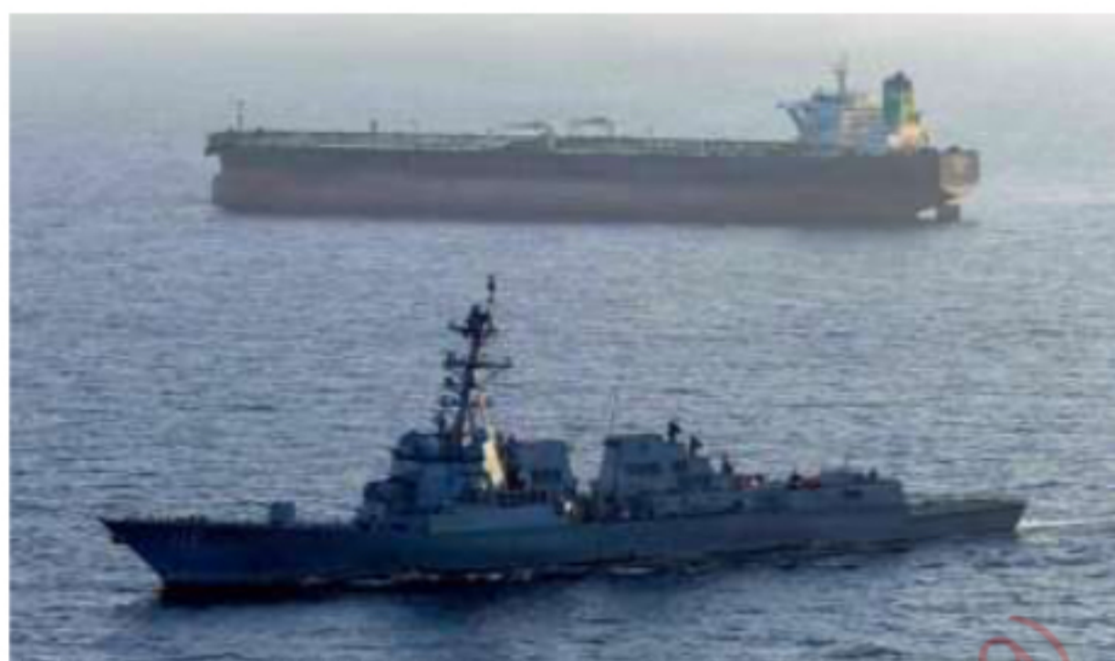
USS Rafael Peralta enforcing a maritime blockade against the Iran-flagged crude oil tanker vessel Stream.