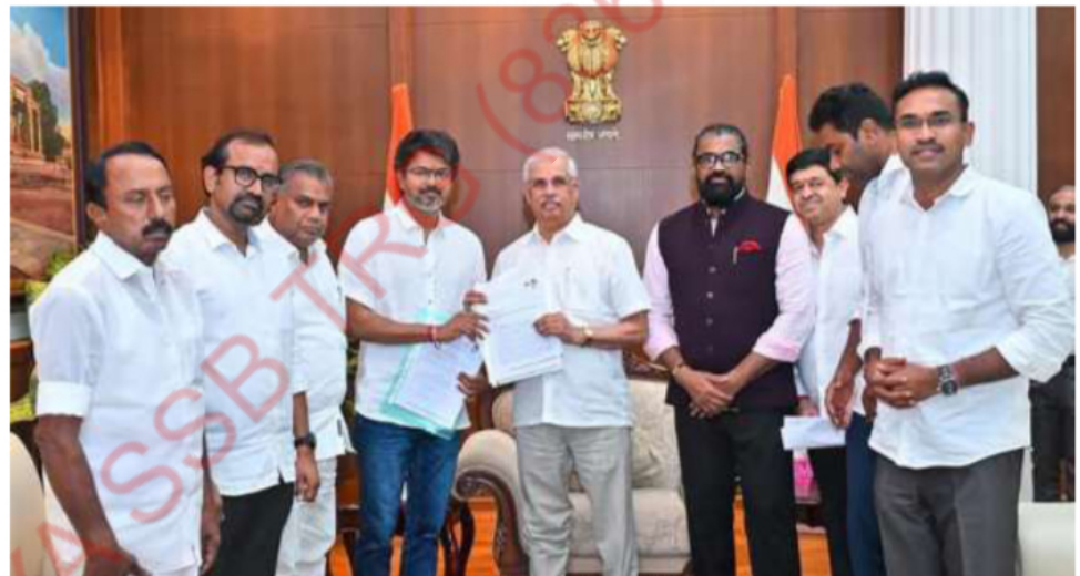
Numbers game: TVK chief Vijay meets Tamil Nadu Governor Rajendra Arlekar at the Lok Bhavan in Chennai on Friday to stake claim to form government.

Late evening, Mr. Vijay called on Tamil Nadu Governor Rajendra Vishwanath Arlekar for the third time, staking claim to form the government, after receiving the support of the Left parties. His post-poll front's tally stood at 116,