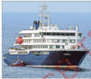
The cruise ship is anchored in Cape Verde.

In case they do develop symptoms, they will have to remain in isolation longer, the