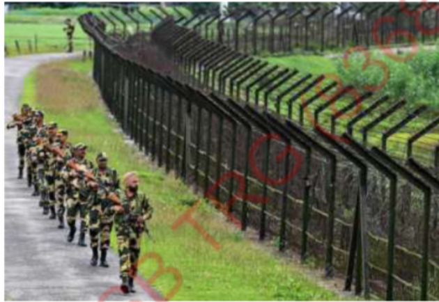
BSF personnel patrol along the fence on the India-Bangladesh border in Golakganj in Assam. FILE PHOTO

The numbers were mentioned in the note verbale that the External Affairs Ministry sent to Dhaka on April 30, hours after the Ministry of Foreign Affairs of Bangladesh summoned the Indian envoy to protest against remarks made by Assam's then Chief Minister Himanta Biswa Sarma. Mr. Sarma had claimed in a media interview that under his government, Indian border guards were "pushing in" suspected Bangladeshi individuals through unguarded parts of the land border.