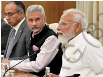
While S. Jaishankar is on a visit to the Caribbean, Prime Minister Narendra Modi will travel to Europe for a five-nation tour. FILE PHOTO

Significantly, the Heads of Mission conference was held almost annually in the previous decade. However, after a break during the COVID-19 pandemic, the