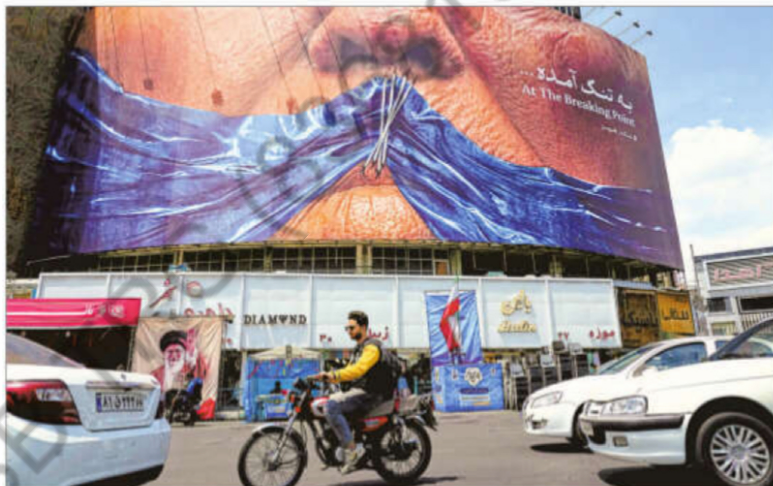
A billboard with a graphic showing the Strait of Hormuz and sewn lips of US President Donald Trump in a square in downtown Tehran on Saturday.

Asked if he might restart strikes on Iran, Trump replied: "I don't want to say that. I mean, I can't tell that to a reporter. If they misbehave, if they do something bad, right now we'll