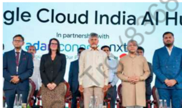
The project will be managed by Google's subsidiary Raiden Infotech in partnership with Adani Infra.

The facility will offer large-scale data storage along with AI cloud infras-