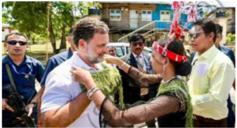
Hearty reception: Congress leader Rahul Gandhi being welcomed by a member of the Nicobarese community during his visit.

made it to the island despite the local administration first refusing permission and later coming up with "excuses" to prevent him from reaching the island. The Andaman and Nicobar Islands Congress in-charge, Manickam Tagore, said in a statement on Tuesday that Mr. Gandhi's visit to Nicobar had been possible even "after all the hurdles created by the administration under Amit Shah".