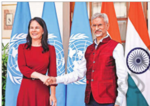
External Affairs Minister S Jaishankar with UNGA President Annalena Baerbock during a meeting in New Delhi on Tuesday.

Addressing the media at the UN House after the meeting,