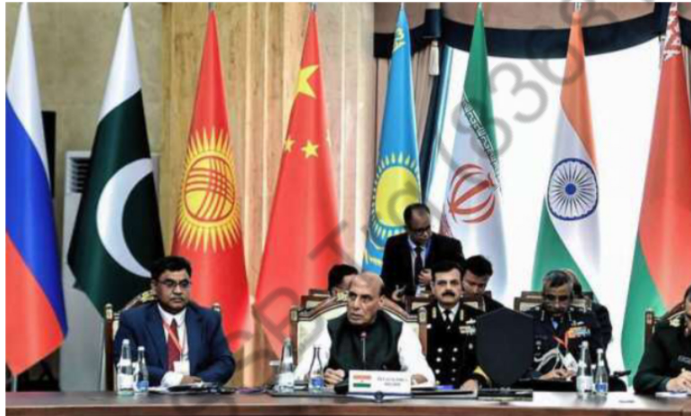
Defence Minister Rajnath Singh addressing the SCO Defence Ministers' meet in Bishkek on Tuesday.

Highlighting the importance of credibility, he said the real test for SCO member states lies in maintaining consistency and rejecting double standard, particularly in addressing state-sponsored cross-border