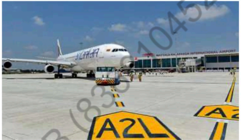
A view of the Mattala Rajapaksa International Airport. The facility is yet to prove commercially viable since its launch in 2013.

India has in the past expressed interest to operate