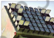
The Atlas drone swarm operations system.

CETC has been responsible for China's major defence electronic breakthroughs, including the technology that gave China its first nuclear bomb, guided mis-