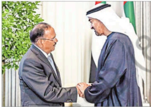
NSA Ajit Doval with UAE President Mohamed bin Zayed Al Nahyan in Abu Dhabi on Saturday.

PM Narendra Modi has spoken to leaders of UAE, Saudi and other Gulf countries in last two months, at least twice, and External Affairs Minister S Jaishankar has also been in touch