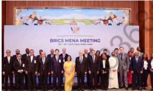
Attendees at the BRICS Deputy Foreign Ministers and Special Envoys meeting in New Delhi.

The issues have set the stage for more difficult negotiations in the weeks ahead as BRICS Foreign Mi-