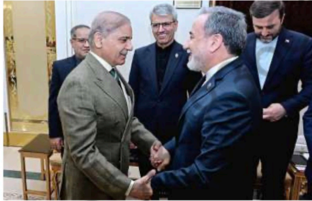
Pakistan's Prime Minister Shehbaz Sharif (left) meets Iran's Foreign Minister Abbas Araghchi during the latter's first visit on April 25.

But in a sign that indirect efforts were ongoing, the Fars news agency reported that Iran had transmitted "written messages"