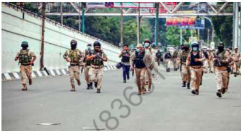
Rapid response: Security forces dispersing protesters during a COCOMI rally in Imphal on Saturday.

The security personnel dispersed hundreds of protesters, mobilised by the Imphal Valley-based Coordinating Committee on Manipur Integrity (COCOMI), by firing tear gas shells when they tried to