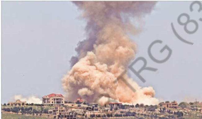
Smoke rises in Lebanon after an explosion, as seen from the Israeli side of the Lebanon border in northern Israel on Saturday.

The Israeli military restated its warning for Lebanese resi-