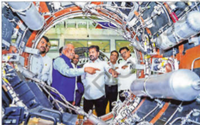
Telangana CM Revanth Reddy flags off payload fairing for Skyroot Aerospace's Vikram-1 rocket, in Sriharikota on Saturday.