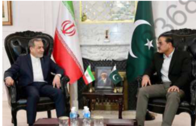
Peace mission: Iran Foreign Minister Abbas Araghchi meeting Pakistan Army Chief Asim Munir in Islamabad on Saturday.

'Principled positions' Mr. Araghchi met Field Marshal Asim Munir, Pakis-