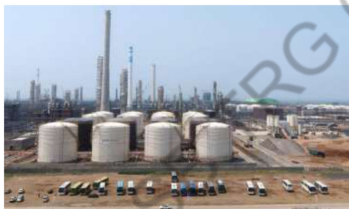
Crude cut-off: Hengli Petrochemical's refinery complex at Changxing island in Dalian, Liaoning province, China.

The Treasury Department targeted Hengli Petrochemical (Dalian) Refinery, which it said is one of Iran's largest customers of crude oil and petroleum products. The department's Office of Foreign Assets Control said it also im-