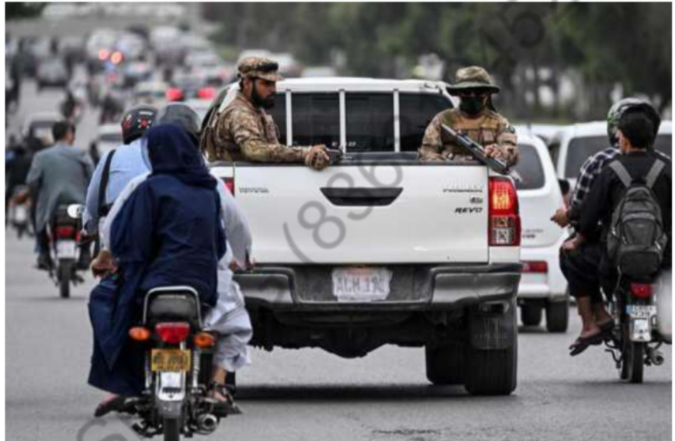
Pakistan Army tightens security ahead of the expected U.S.-Iran peace talks in Islamabad. Foreign Minister Abbas Araghchi said he would travel to Pakistan on Friday.

Earlier, two Pakistani officials said Mr. Araghchi was heading to Pakistan with a small government delegation. Islamabad has sought to reinject momen-