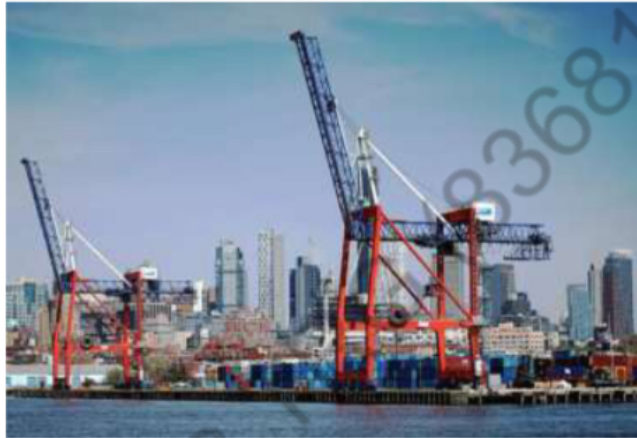
The talks covered multiple areas like market access, technical barriers to trade, customs and trade facilitation.

The framework agreed to in February also reaffirmed the two countries' commitment towards achieving a broader Bilateral Trade Agreement (BTA). "In pursuance thereof, the Indian side visited Washington D.C. for an in-person round of meetings