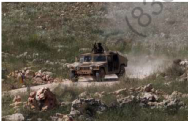
War zone: An Israeli armoured vehicle seen inside Lebanon as the ceasefire was extended on Friday.