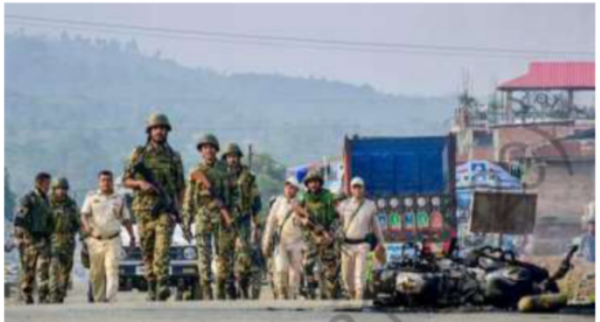
Mounting tension: Security personnel patrol the Kangleitongbi area in Imphal West district of Manipur on Thursday.