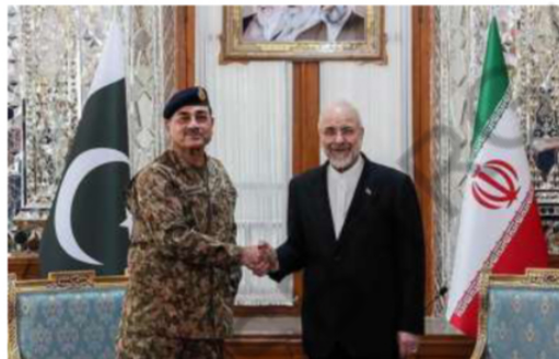
Close ties: Mohammad Bagher Ghalibaf, right, shaking hands with Gen. Asim Munir before their meeting in Tehran.

After more than five weeks of war that saw the killing of Supreme Leader Ali Khamenei and top security official Ali Larijani,