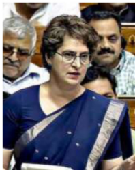
Priyanka Gandhi Vadra

Participating in the debate on the three Bills seeking changes to the women's quota law, and the setting up of a Delimitation Commission, Ms. Gandhi alleged the first steps towards weakening democracy had been taken when the government made the media and the Election Commission of India captive, and was now taking