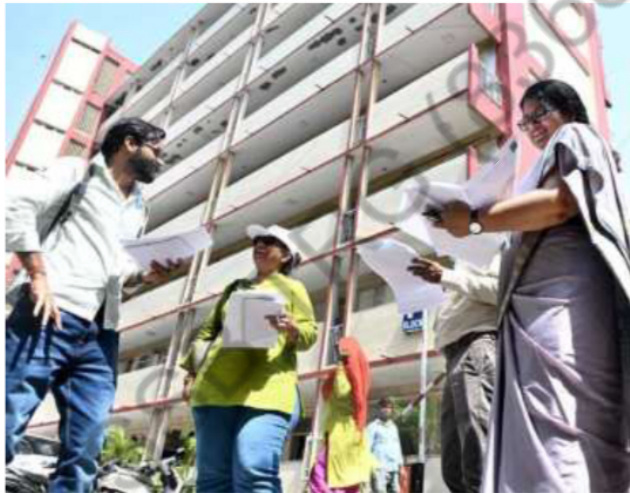
Enumerators, all government school teachers, collecting data for Census 2027 in New Delhi on Thursday.

The first phase, involving house-listing and housing census, focuses on gathering detailed data on