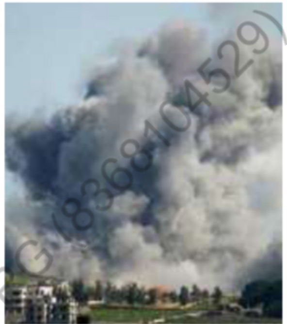
Smoke rises from Kfar Tibnit, a Lebanese village attacked by Israel, on Thursday.

The ceasefire, if comes into effect, could strengthen the two-week U.S.-Iran ceasefire that was announced on April 8. Extending the truce to Lebanon has been one of the key demands of Iran. When Mr. Trump announced the Iran truce, Is-