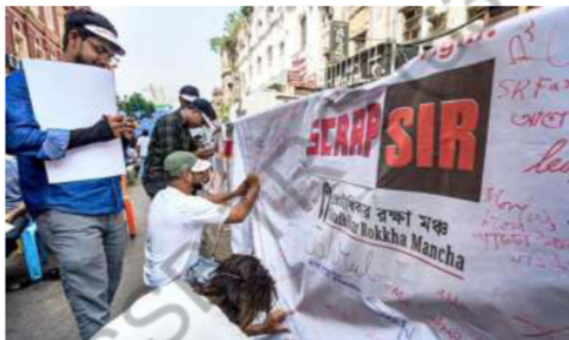
Members of Votadhikar Raksha Mancha staging a protest demanding voting rights for deleted voters in Kolkata.

The court, issuing directions in exercise of its extraordinary constitutional powers under Article 142, ordered the Election Com-