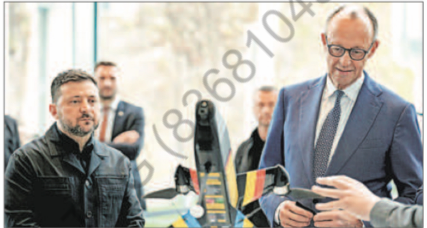
German Chancellor Friedrich Merz (right) with Ukraine's President Volodymyr Zelenskyy in Berlin on Tuesday.

US-led diplomatic efforts to end Russia's war on its neigh-