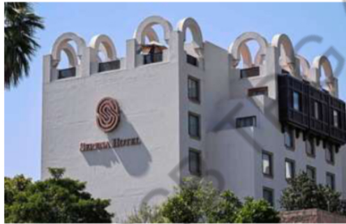
Hopeful sequel: A security guard stands atop the Serena Hotel, the venue where Iran and U.S. held peace talks earlier in Islamabad.

Talks aimed at permanently ending the conflict – which began February 28 with U.S. and Israeli strikes on Iran – failed to