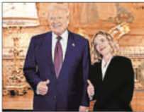
Donald Trump with Italian PM Giorgia Meloni at Mar-a-Lago in Palm Beach, Florida. FILE

The White House declined to comment on the reported quotes. Meloni's office also declined to comment, but politi-