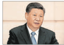
China's President Xi Jinping

Xi said they should "jointly safeguard genuine multilateralism," strengthen communi-