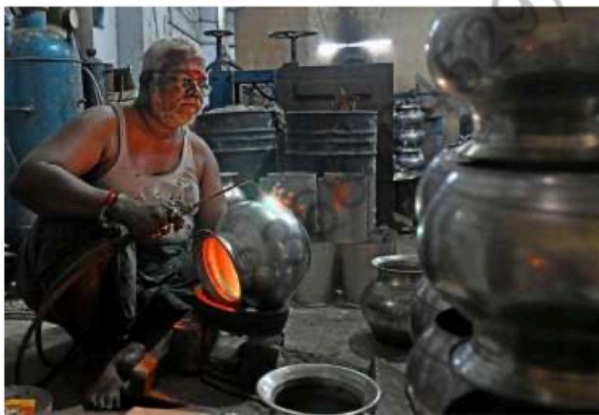
ifs and buts: The calorific value of PNG is a tad lower than LPG, according to officials of some MSMEs.