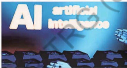
Digital humans are computer-generated virtual beings that mimic human appearance, conversations and emotions.

Service providers are advised to prevent and resist content that is sexually suggestive, depicts horror, cruelty or incites