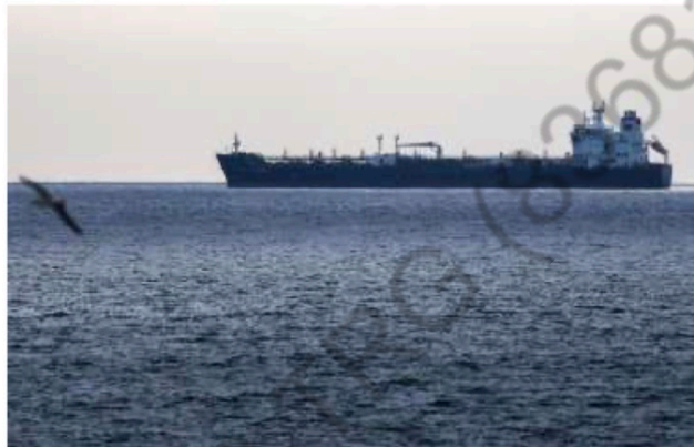
A diversion: Ping Shun is owned and managed by companies located in Shandong, China. (For representation purpose only).

Ping Shun was sanctioned by the U.S. in February of this month. The sanctions notice says that the ship was involved in Pars crude