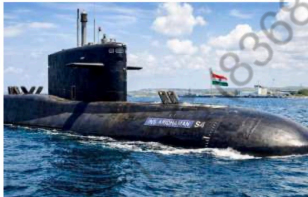
The nuclear submarine INS Aridhaman ahead of its commissioning ceremony in Visakhapatnam.

kept under wraps, Defence Minister Rajnath Singh posted a cryptic message on X, describing the submarine as: "It's not words but power, 'Aridhaman'!"