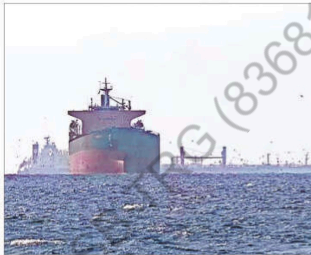
The fuel Green Sanvi is carrying will meet half a day's worth of India's pre-West Asia war LPG consumption.

LPG tankers, four crude oil tankers, one liquefied natural gas (LNG) tanker, one chemical products tanker, three container ships, two bulk carriers, and two vessels undergoing routine maintenance.