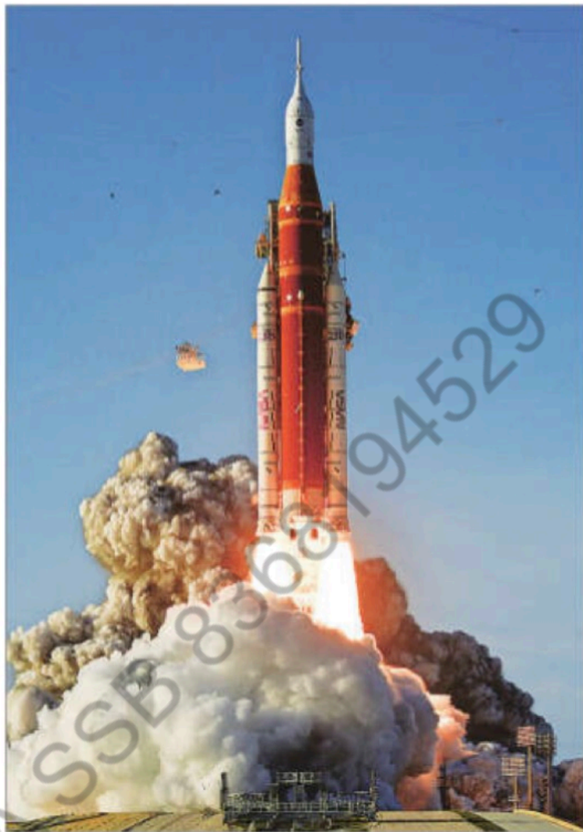
NASA's Artemis II mission to fly by the moon, comprising of the Space Launch System (SLS) rocket with the Orion crew capsule, lifts off from the Kennedy Space Center, Florida on Thursday.

Until then, the astronauts are savouring Earth's views from thousands of miles high. Koch told Mission Control that they can make out the entire coastlines of continents and even the South Pole. "It is just absolutely phenomenal," radioed Koch. The mission is due to end on April 10. WITH INPUTS FROM AP