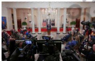
Donald Trump speaks during a televised address from the Cross Hall of the White House in Washington DC on Saturday.

While the main objective of the speech appeared to make the case for the war to the American public, it also underscores the limited options Mr. Trump has in winding down the con-