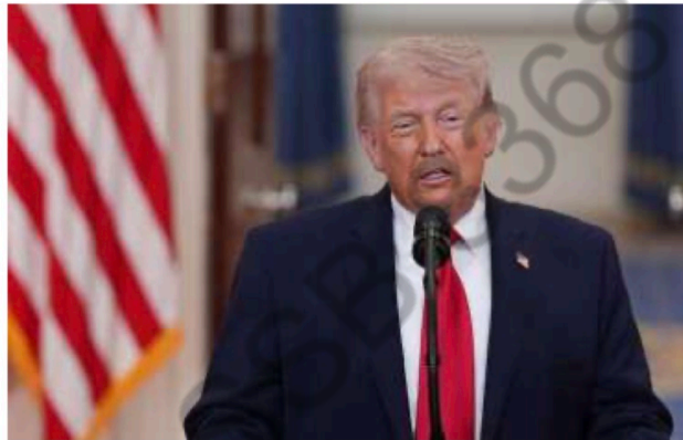
U.S. President Donald Trump speaking about the Iran war from the Cross Hall of the White House in Washington on Wednesday.

Mr. Trump has insisted the strait can be taken by force – but said it is not up to the U.S. to do that. In an address on Wednesday