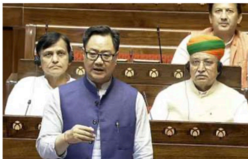
Union Minister Kiren Rijju speaks in the Rajya Sabha during the second part of the Budget Session of Parliament on Thursday.

"The government will propose that the House be adjourned, and we will meet very soon, for a specific period, for purposes already known to members," Union Parliamentary Affairs Minister Kiren Rijju said.