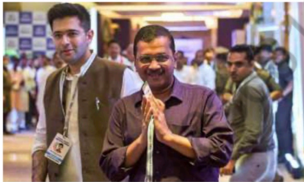
In happier times: Former CM Arvind Kejriwal with MP Raghav Chadha, who many within AAP said was given undue importance. FILE PHOTO