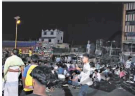
Row over roll: People lay siege to the BDO office at Kaliachak Block II in Malda, where seven judicial officers were gheraoed on Wednesday.

Hundreds of judicial officers have been deployed on the basis of a Supreme Court order to function as Election Registration Officers and adjudicate objections raised by voters ex-