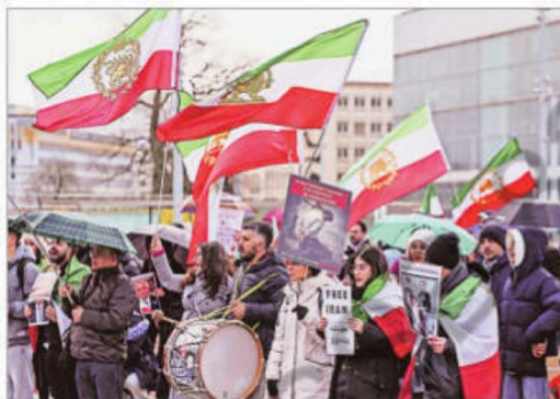
People carry pre-Iranian Revolution national flags as they protest near the United Nations office in Geneva on Tuesday.

force to the Middle East to press Tehran to make concessions in the decades-long nuclear dispute and President Donald Trump has said "regime change" in Tehran may be the best thing that can happen.