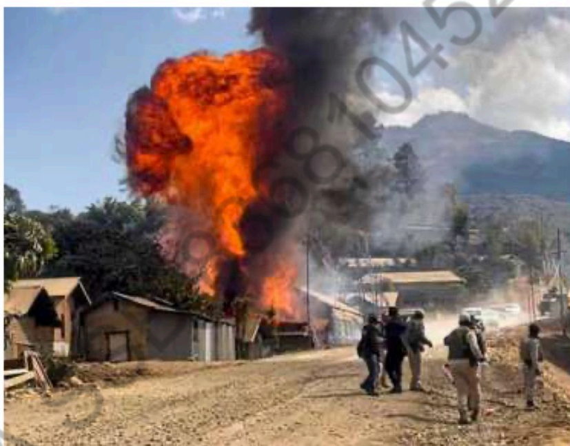
Gutted by violence: Houses set ablaze by armed miscreants at Litan Sareikhong village in Ukhrul district of Manipur last week.

“Along with them, the remaining students from the Kuki community of JNV Ramva were also evacuated as a precautionary mea-