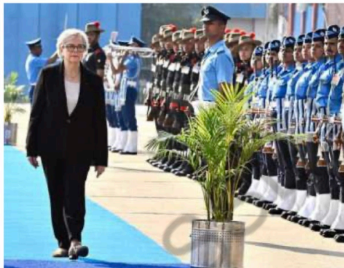
Expanding ties: French Defence Minister Catherine Vautrin arrives at the HAL airport in Bengaluru on Tuesday.

The cooperation agreement was signed by India's Defence Secretary and France's Deputy Director General for International Relations and Strategy. Besides, both countries an-