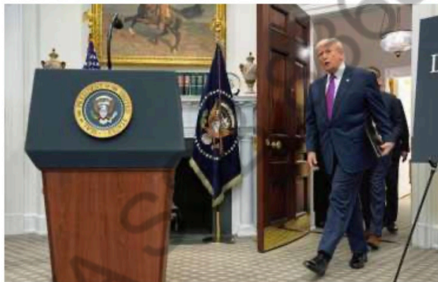
President Donald Trump arrives in the White House Roosevelt Room to make the announcement, on Thursday.

But it also places a host of other climate rules in jeopardy, including carbon dioxide emissions from power plants and methane