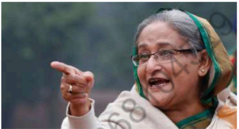
India should deal with the issue of deposed Bangladesh PM Sheikh Hasina's presence on Indian soil, BNP sources said.

"Out of all issues, it is the border killings by the Border Security Force of India that creates great difficulty for the Government of Bangladesh. Reports of killings in the bordering areas immediately inflames passion especially in university campuses where protests break out escalating the sit-