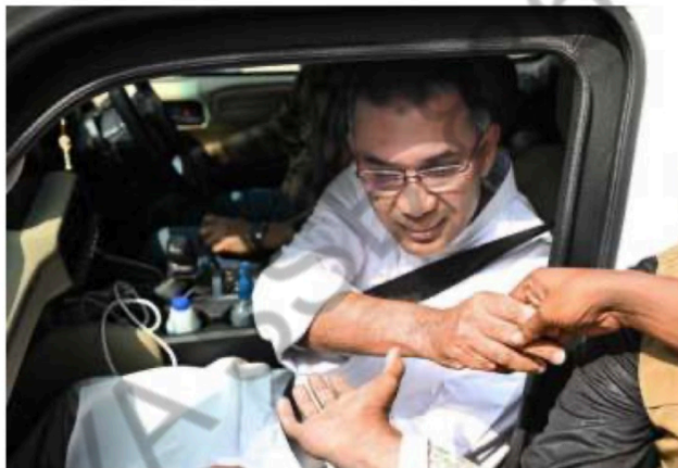
Big win: Bangladesh Nationalist Party chairman Tarique Rahman greets his supporters in Dhaka on Friday.

Mr. Rahman has started receiving congratulatory messages from world lead-