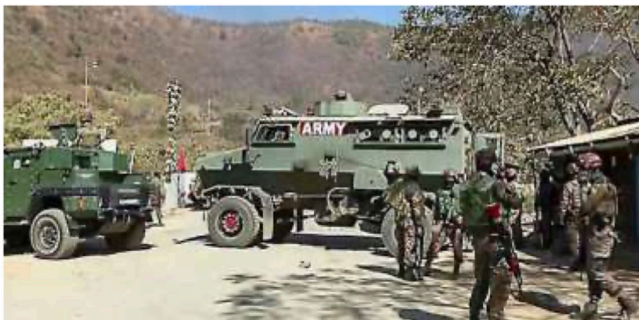
Security forces deployed at Litan village in Ukhrul. FILE PHOTO