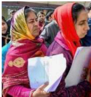
People waiting during hearings under the special intensive revision of electoral rolls in Nadia, West Bengal.

Notices for 'logical discrepancies' in enumeration forms were issued to