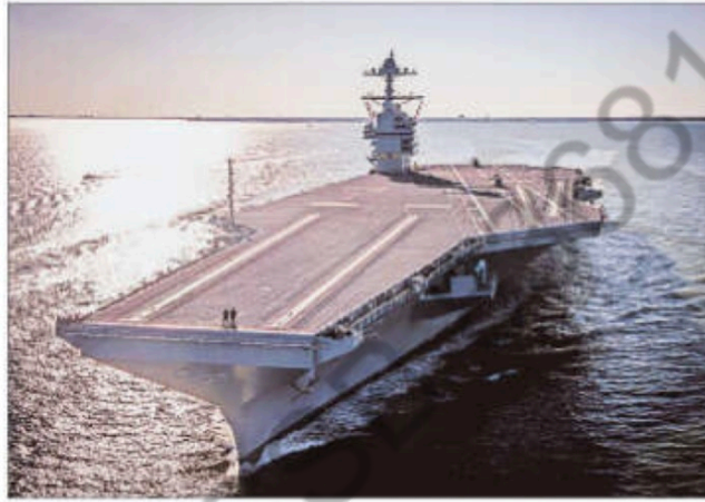
The USS Gerald R Ford on one of its first sea trials in April 18 2017.

"There was nothing definitive reached other than I insisted that negotiations with Iran continue to see whether or not a Deal can be consummated. If it can, I let the Prime Minister know that will be a