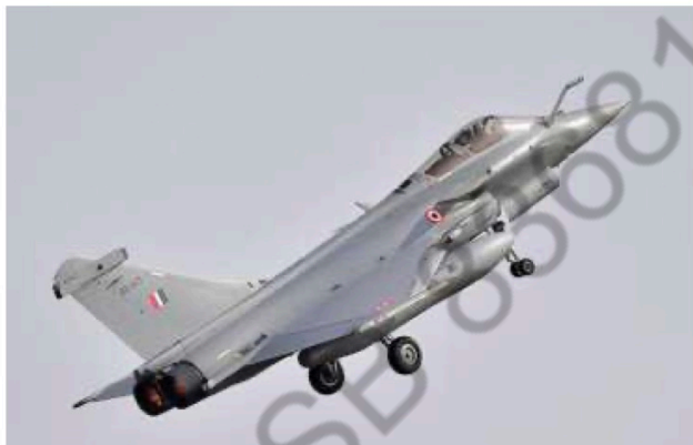
Vayu Shakti, an upcoming IAF exercise, will be held at the Pokharan air-to-ground range in Rajasthan on February 27.