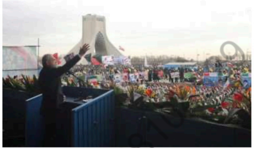
Masoud Pezeshkian speaks during the 47th anniversary of the Islamic Revolution in Tehran on Wednesday.

“From the very first days of the Revolution, the enemies tried to destroy our fledgling movement through actions such as creating division and staging coups,” President Ma-