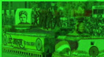
Proud moment: A tableau celebrating 150 years of Vande Mataram during the Republic Day Parade.

■ Standing is not required if it is played as part of a newsreel or documentary