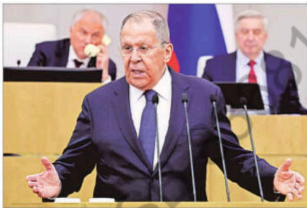
Russian Foreign Minister Sergey Lavrov at the State Duma in Moscow on Wednesday.

A new meeting between the leaders of the two countries is expected to take place on the sidelines of the BRICS summit, Lavrov told the Russian Parliament. "Russia is ready to go as far in relations with India as New Delhi would desire", he