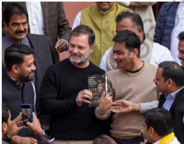
Congress leader Rahul Gandhi shows a copy of Four Stars of Destiny during the Budget Session of Parliament in New Delhi.

Investigators are probing how the content entered the public domain