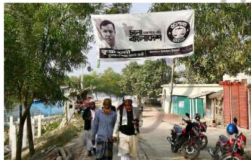
Poll fiasco: Residents walking past a campaign banner of a Jamaat-e-Islami candidate in Bangladesh's Jessore district.

"At a time when all banks, financial institutions, business transac-