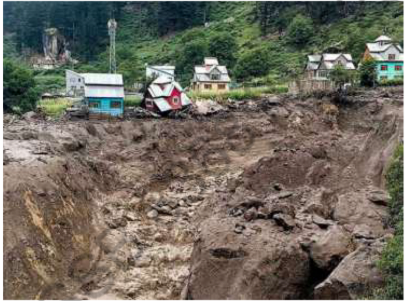
Washed away: An area damaged in the flash flood in Kishtwar district of Jammu and Kashmir on Thursday.