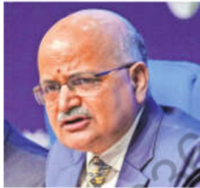
BVR Subrahmanyam, CEO, NITI Aayog. File

Subrahmanyam's comments come amid risks to India's economic growth from the 50 per cent tariff announced by the US earlier this month, with the 25 per cent penalty component coming into force on August 27. While