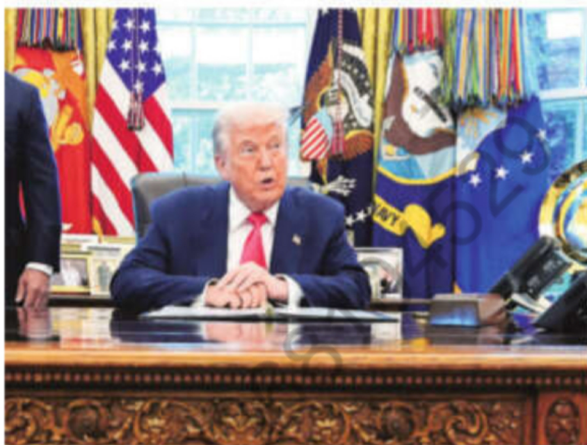
President Donald Trump in the Oval Office on Thursday.

His comments signalled Russia will raise nuclear arms control as part of a wide-ranging discussion on security with Trump. A Kremlin aide said they would also discuss the "huge untapped potential" for Russia-U.S. economic ties.