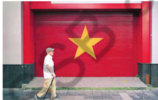
Vietnam's transformation into a global manufacturing hub lifted millions of its people from poverty, like China.

Investment has soared, driven partly by U.S.-China trade tensions, and the U.S. is now Vietnam's biggest export market. Once-quiet suburbs have