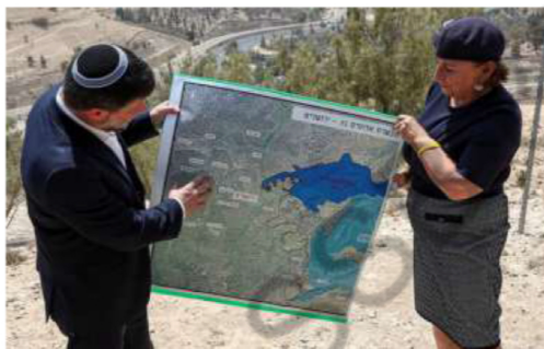
Thawing plans: Bezalel Smotrich, left, holds a map that shows the E1 settlement scheme, at a press meet on Thursday.

In a statement headlined "Burying the idea of a Palestinian state", Mr. Smotrich's spokesperson announced the decision and said the development would build 3,401 houses for Israeli settlers between