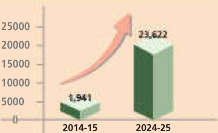
Value (₹in crore)