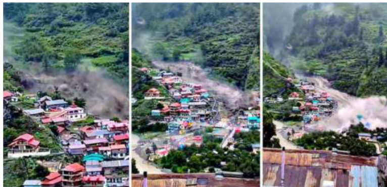
Blink of an eye: A series of images shows floodwater surging downhill and destroying buildings in Dharali town, located 8,600 feet above sea level, in Uttarakhand, on Tuesday.

Residents were heard yelling warnings to their acquaintances to run for their lives. The entire market area of the popular tou-