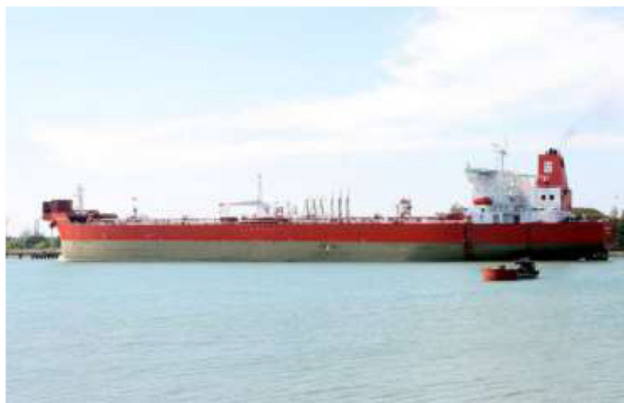
Weighing options: India could continue to buy crude from Russia or seek alternative partners. FILE PHOTO

The MEA statement called out both the U.S. and the European Union for their double standard, given they themselves continued to purchase Russian