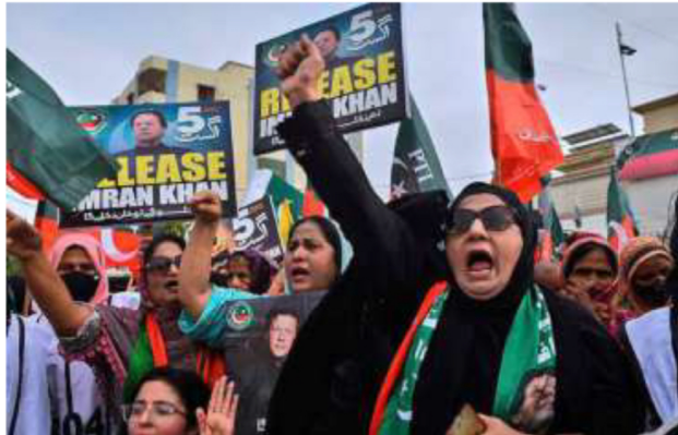
Leader's cause: Supporters of Imran Khan's PTI party take part in a rally in Hyderabad in Pakistan on Tuesday.

"Today, August 5, marks the second anniversary of the incarceration of former Prime Minister Imran Khan with all basic human