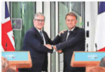
British PM Keir Starmer with French President Emmanuel Macron.

Under the new deal, France has agreed to accept the return of undocumented people arriving in Britain by small boats, in exchange for Britain agreeing to accept an equal number of legit-