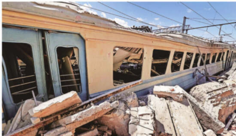
Debris lies next to a train damaged during a Russian strike, in Kharkiv, Tuesday.

European allies and Canada are buying most of the equipment