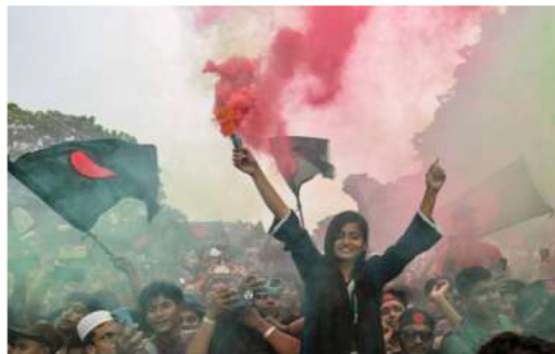
Course reset: Bangladeshis celebrate at an event organised by the interim government in Dhaka on Tuesday.

The Declaration, launched on the anniversary of the fall of the Hasina government, blamed the Awami League for creating a one-party state in Bangladesh after 1971 and said the party was