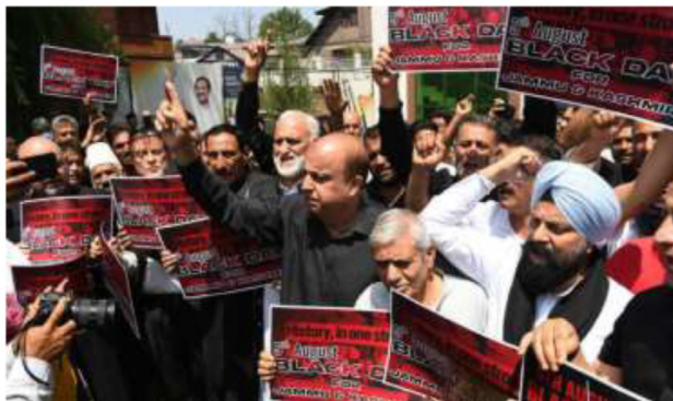
Congress supporters hold placards as they demand the restoration of J&K Statehood in Srinagar on Tuesday.

“August 5 marks a black day not just for Jammu and Kashmir, but for the entire