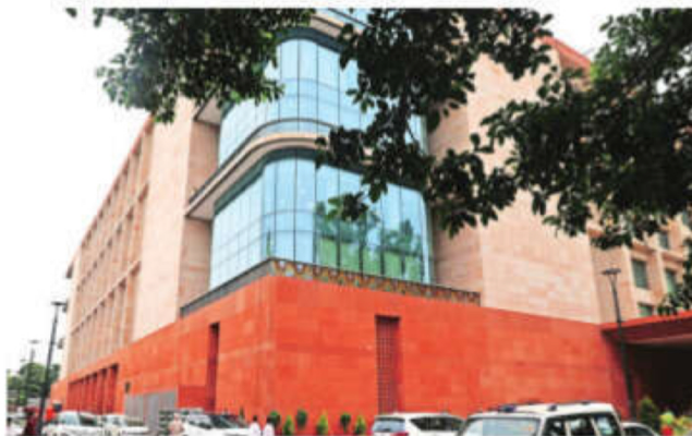
The first of the 10 buildings, Kartavya Bhawan (KB) 3, will be inaugurated by Prime Minister Narendra Modi on Wednesday.

The work on the buildings, CCS 4 and CCS 5 at the site of Shastri Bhawan and Krishi Bha-