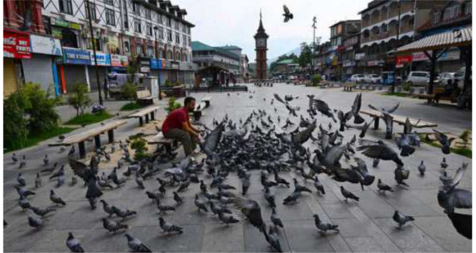
A man feeds pigeons in front of the Clock Tower (Ghanta Ghar) in Srinagar of Jammu and Kashmir on Tuesday as the erstwhile State marks six years since the abrogation of Article 370.

"Therefore, there is no impediment of security concerns, violence or any