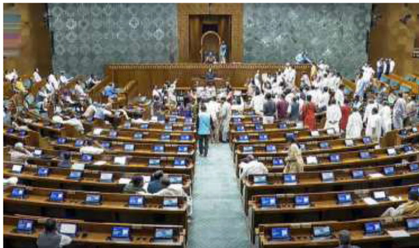
Opposition MPs protesting in the Well as Lok Sabha Speaker Om Birla conducts the proceedings in the House.

The Rajya Sabha has listed for passage on Monday a resolution from Union Home Minister Amit Shah on the extension of President's Rule in Manipur by another six months with effect from August 13.