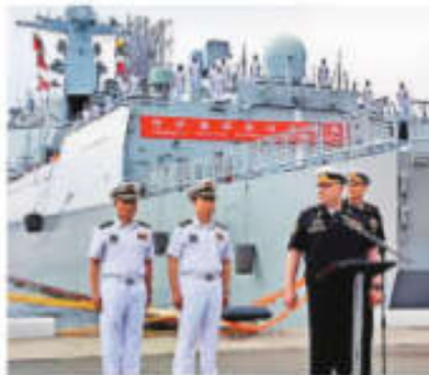
Chinese and Russian naval officials in Vladivostok, Russia, on Thursday.

The drills are taking place two days after U.S. President Donald Trump said he had ordered two nuclear submarines to be positioned in "the appropriate regions" in response to remarks by former Russian president Dmitry Medvedev. However, they were scheduled well before Trump's action.