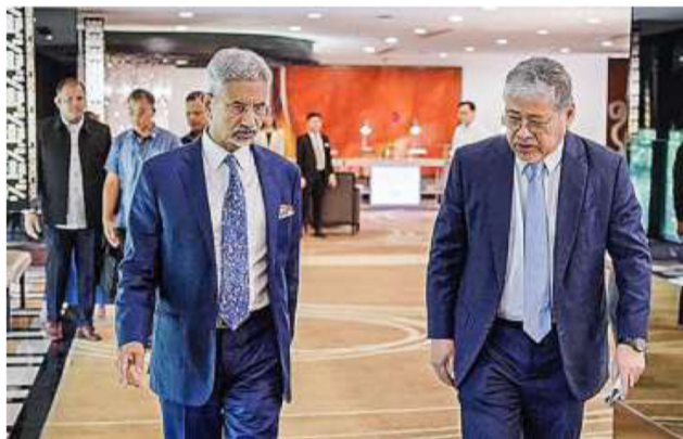
Bilateral brief: External Affairs Minister Jaishankar with Philippine Secretary of Foreign Affairs Enrique A. Manalo in March 2025.

Mr. Marcos Jr. will hold delegation-level talks with Prime Minister Narendra Modi with the two sides signing multiple agreements and MoUs. On August 7, he will visit Bengaluru.