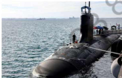
The U.S. keeps nuclear-armed submarines on patrol as part of its nuclear triad of land, sea and air-launched weapons.

“Based on the highly provocative statements of the Former President of Russia, Dmitry Medvedev..., I have ordered two Nuclear Submarines to be positioned in the appropriate regions, just in case these foolish and inflammatory statements are more than just that,” Mr.