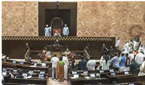
Uproar in House: Rajya Sabha Deputy Chairman Harivansh conducts proceedings in the House amid protest on Friday.

ter and the rules of this House are very clear. I cannot allow [a discussion]," he said, urging the protesting members to return to their seats. The House was then adjourned till noon.