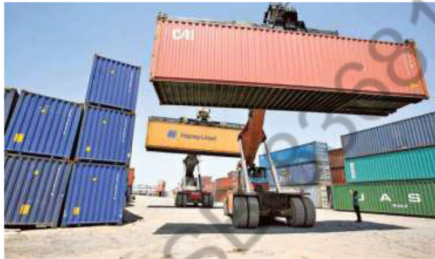
Pharmaceutical products and electronics have also been excluded from the 25% tariff on Indian goods. FILE PHOTO

However, the executive order he signed thereafter only gives effect to the 25% tariff on Indian goods coming to the U.S. Even this has an exclusion list that includes finished pharmaceutical products (tablets, injectables and syrups), active pharmaceutical ingredients, electronics and ICT goods (semiconductors,