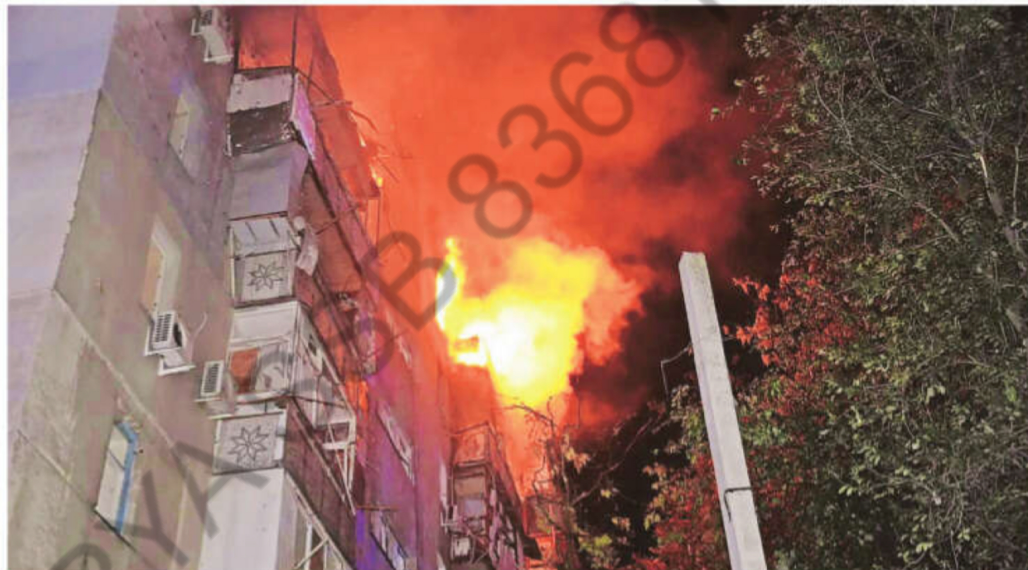
A residential building burns after a Russian air attack in Odesa, in which one person was killed, on Saturday.

According to Zelenskyy, six other people were wounded in the attack on Odesa, including a child, and critical infrastructure was damaged in Ukraine's northeastern Sumy region.