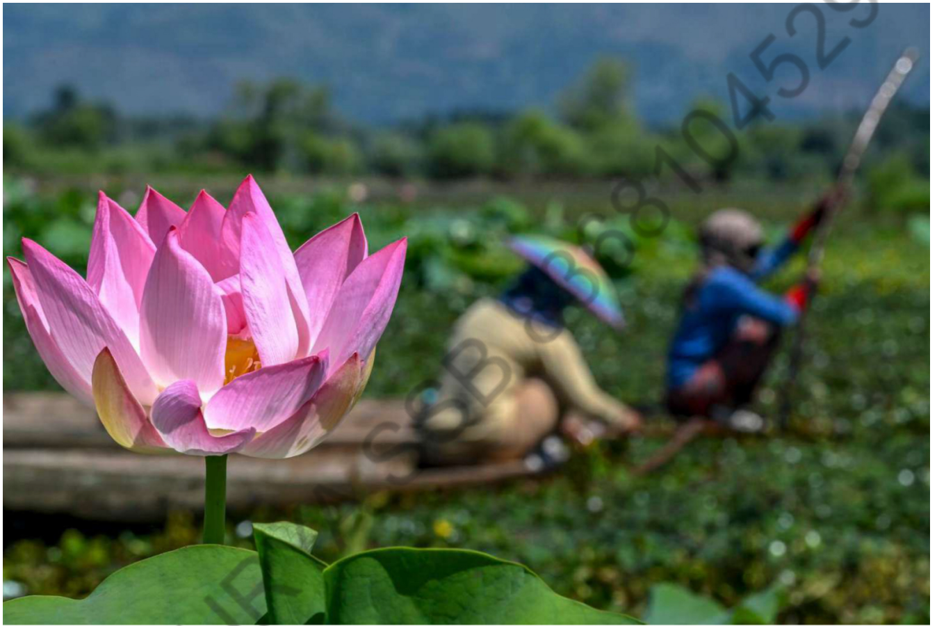
sy picture: A big lotus in full bloom at the Wular lake in Bandipora district. Lotuses have bloomed again in the freshwater lake, one of the largest in the Indian subcontinent, after nearly three decades.