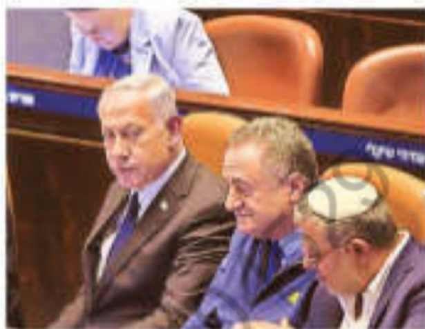
Israeli Prime Minister Benjamin Netanyahu at the Knesset on Monday.

tween Israel and Palestinian militant group Hamas aim to halt fighting in Gaza for 60 days to allow half of remaining hostages held by Hamas to be released and aid to flow into the battered enclave. It would also open a further phase of talks on ending the war entirely.