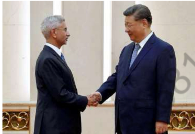
Friendly ties: External Affairs Minister S. Jaishankar during a meeting with Chinese President Xi Jinping in Beijing.

Mr. Jaishankar's comments came a month after the SCO Defence Ministers' meeting failed to issue a joint statement following differences over the references to terrorism. While no statement was issued af-