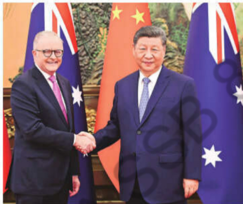
Australian PM Anthony Albanese with Chinese President Xi Jinping at Great Hall of the People in Beijing on Tuesday.

Albanese said a decade-old free trade agreement with China, Australia's largest trade partner, would be reviewed, and that the two leaders agreed to potential new cooperation on de-carbonisation. Albanese said he raised Australia's concerns over the