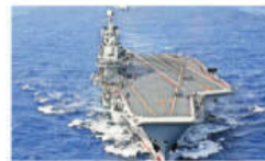
A Chinese aircraft carrier in the South China Sea.