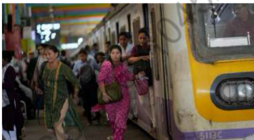
For females of all age groups in both rural and urban areas, the LFPR was 24.5% in June and it was 25.5% in May.

✓ The Centre said the marginal decline in LFPR and worker population ratio (WPR) in June was largely influenced by seasonal agricultural patterns, intense summer heat limiting outdoor physical work, and a shift of some unpaid helpers, particularly from higher-income rural households, towards domestic chores. It said the share of rural women workers in agriculture dropped to