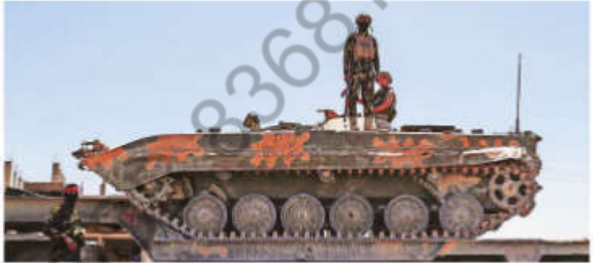
Syrian forces on an armored personnel carrier as they withdraw from Sweida city on Tuesday.

The latest sectarian violence to emerge under Syria's new leaders began with tit-for-tat kidnappings and attacks between members of Bedouin