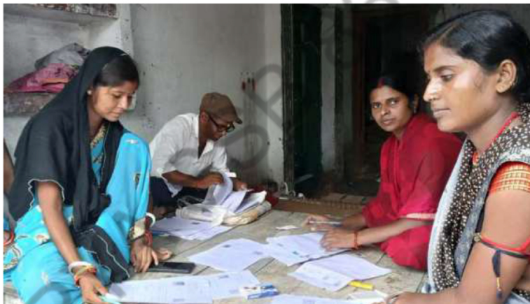
Crucial data: Enumeration activities going on at Nawada for the Bihar poll roll revision on Sunday.

The SIR began on June 25 and the last date for voters to submit enumeration forms given by booth-level officers (BLOs) is July 25, following which a draft list will be brought out on August 1. The EC said a proper enquiry will be conducted