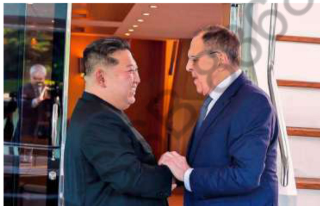
Mutual beneficiaries: North Korea's Kim Jong-un, left, meets with Russia's Sergei Lavrov in Wonsan in North Korea.

Mr. Kim met Mr. Lavrov in the eastern coastal city