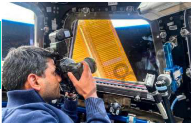
Stunning shots: Indian astronaut Shubhanshu Shukla aboard the International Space Station during his Ax-4 mission.

weeks at the ISS, the astronaut will be embarking on his journey back to earth on Monday. Mr. Shukla, pilot of the Axiom Mission 4, along with three other crew members, is scheduled to undock from the ISS's Harmony module at 4.35 p.m. IST.