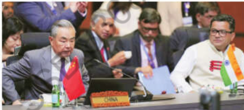
China Foreign Minister Wang Yi and MoS for External Affairs Pabitra Margherita at East Asia Summit in Kuala Lumpur.

This will be Jaishankar's first visit to China since the start of the military standoff along the Line of Actual Control in eastern Ladakh in May 2020.