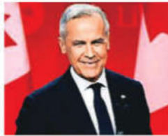
Canadian Prime Minister Mark Carney.

An exclusion for goods covered by the United States-Mexico-Canada Agreement (USMCA) on trade was expected