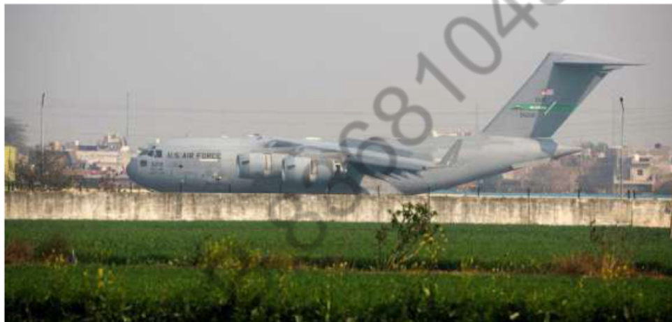
On the radar: The United States sent back hundreds of Indian immigrants on a military plane in February. The ED is investigating a money laundering angle linked to illegal immigration.

The operations form part of the ED's probe into the money laundering angle linked to the illegal immigration of individuals