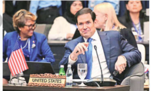
US Secretary of State Marco Rubio had his first in-person talks with the Chinese foreign minister in Kuala Lumpur.

Wang sharply criticised Washington during talks with Asian counterparts in Malaysia,