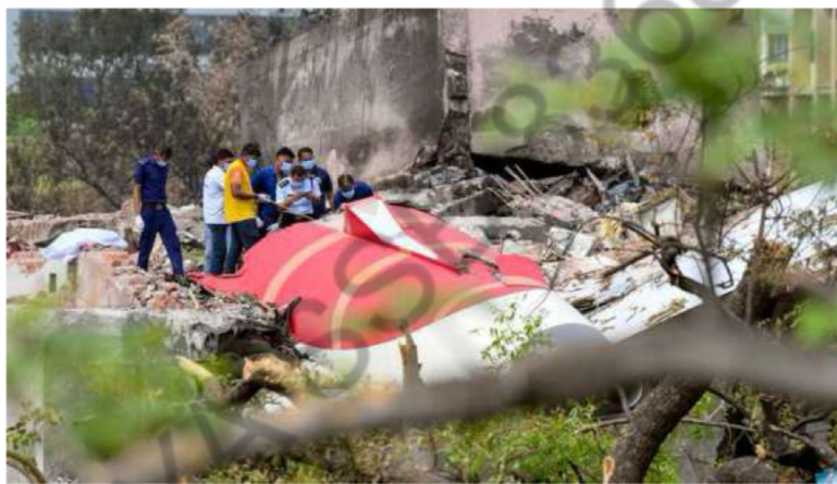
Debris analysis: Forensic team checks wreckage of the aircraft in Ahmedabad on Saturday. VIJAY SONEJI

The order states that it will not substitute other enquiries by relevant organisations, referring to the main accident probe conducted by the Aircraft Accident Investigation Bureau (AAIB) which reco-