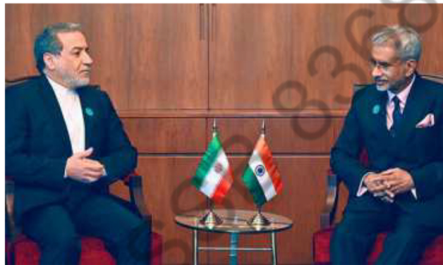
Dialling down: External Affairs Minister S. Jaishankar in a meeting with Iranian Foreign Minister Abbas Araghchi. FILE PHOTO

The Minister-level phone conversation was held shortly after Prime Minister Narendra Modi received a phone call from his Israeli counterpart, Benjamin Netanyahu. Mr. Modi had called for “early restoration of peace”, and called for stability in the Gulf region that is vital for