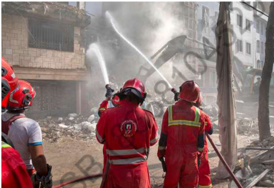
Deepening crisis: Firefighters extinguishing a fire in a building in Tehran after the Israeli attack on Iran on Friday.

Israel's firefighting service said its teams were responding to several “ma-