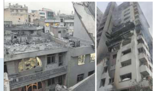
Dawn attack: Debris and rubble at some of the sites of an Israeli strike in Tehran on Friday.

The Zionist regime has committed a crime in our dear country with its satanic, bloodstained hands. That regime should anticipate a severe punishment