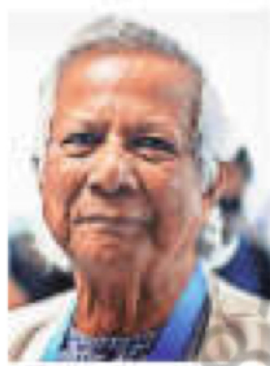
Bangladesh Chief Advisor Muhammad Yunus

mounting from opposition groups for an earlier vote, with the BNP warning of public unrest if elections were delayed beyond December.