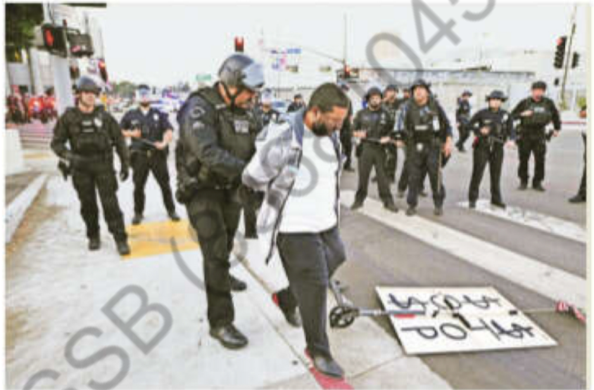
A demonstrator detained on Thursday in Los Angeles.

used for direct police action under the Insurrection Act was in 1992, when the California governor at the time asked then President George H W Bush to help respond to Los Angeles riots over the acquittal of police officers who beat Black motorist Rodney King.