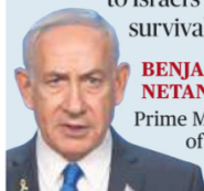
BENJAMIN NETANYAHU Prime Minister of Israel

We are at a decisive moment in Israel's history... Israel launched Operation Rising Lion, a targeted military operation to roll back the Iranian threat to Israel's very survival