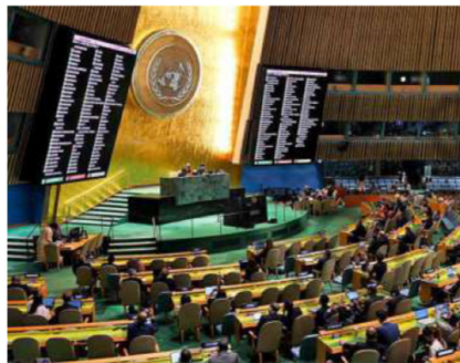
Ayes and nays: The tally is displayed on a screen after UNGA voted on a draft resolution calling for a ceasefire in Gaza.

The resolution at the UNGA on Thursday evening was introduced by Spain, and applause broke out in the assembly as it was passed with more than 4/5ths of all countries voting for it. India was one of 19 abstentions on the vote along with Albania, Dominica, Ecuador, Kiribati, Malawi and other countries, while 149 of 180 countries voted for the resolution entitled "Protec-