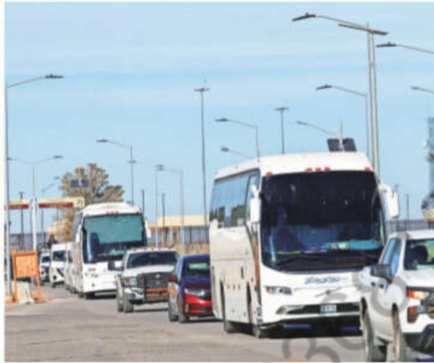
Migrants, mostly Venezuelans, are transported aboard a bus from Mexico's National Institute of Migration after being expelled from the US, through the Jeronimo-Santa Teresa border crossing in Ciudad Juarez on Friday.

At a joint press conference with President Maia Sandu of neighbouring Moldova, Zelenskyy said Ukraine also needed to be involved in any discussions on ending the war for such negotiations to have any meaningful impact.