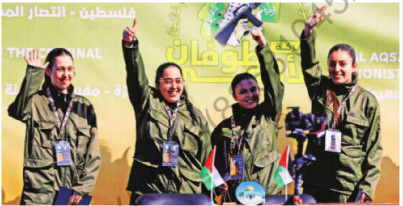
Four Israeli soldiers released by Hamas in Gaza City on Saturday.

Israel halts families from returning to North Gaza over delay in a hostage's release, Hamas says she will be freed soon