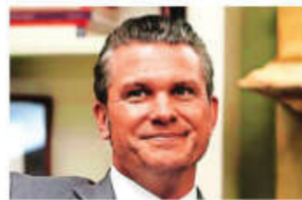
Pete Hegseth, a former Fox News host, faces charges of heavy drinking, aggressive behaviour towards women

All 47 Democrats voted against Hegseth, a former Fox News host. Three Republican